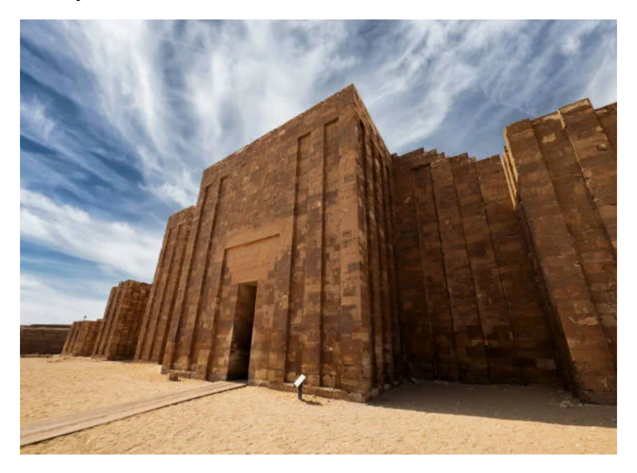
Day 2: Memphis, Sakkara, Pyramids Tour