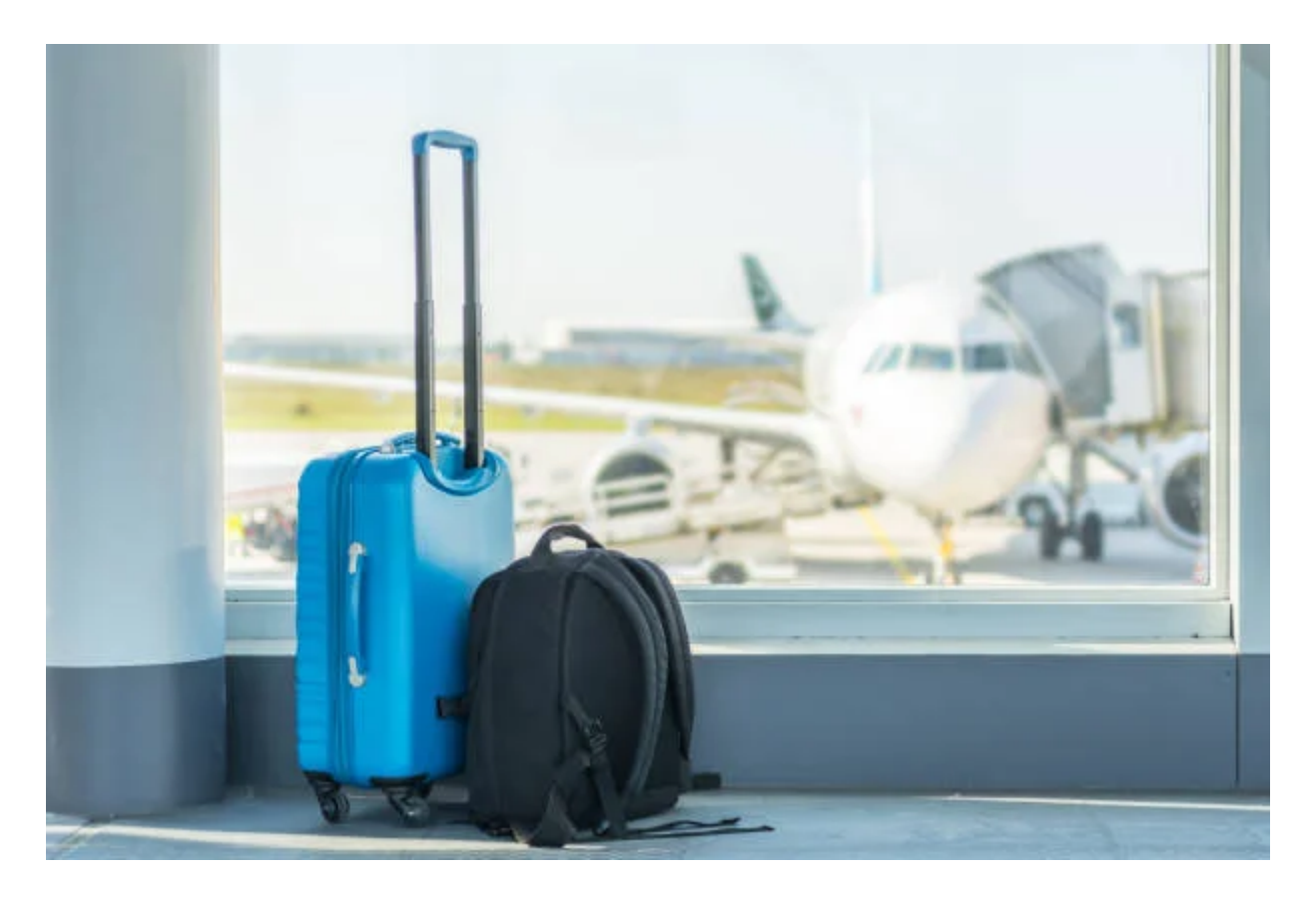
Day 1: Arrival