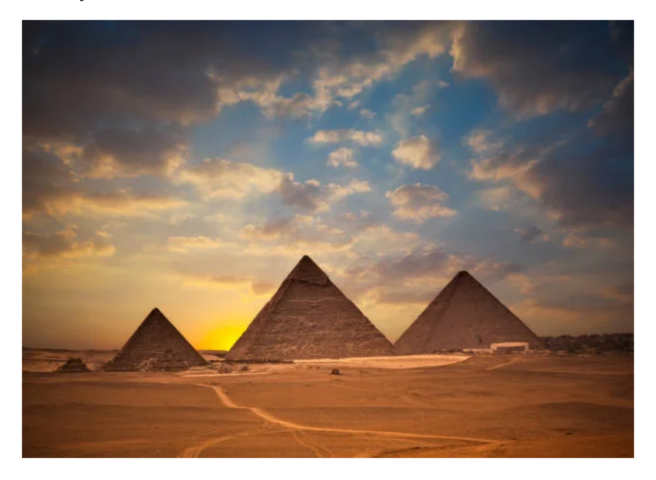
Day 2: Memphis, Sakkara, Pyramids Tour