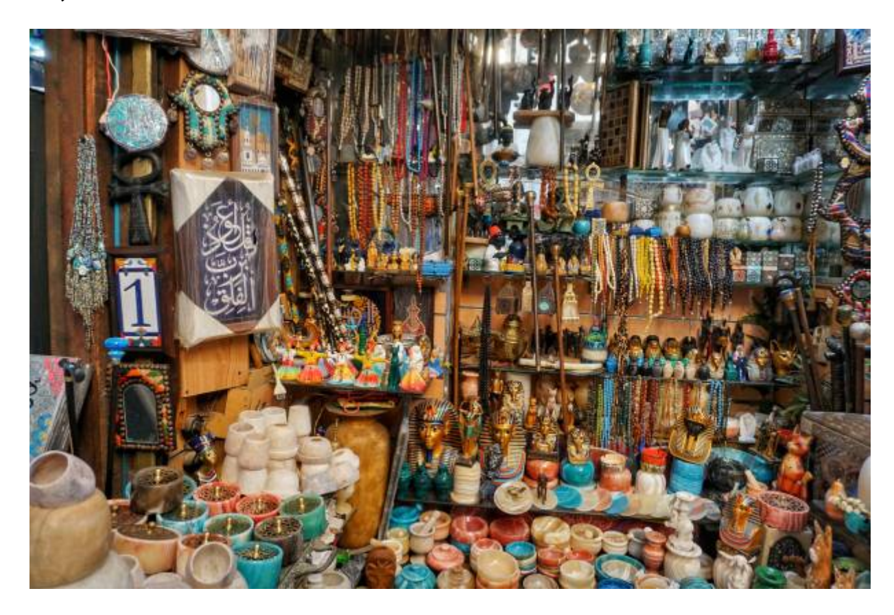
Day 8: Fly back to Cairo, Khan El Khalili