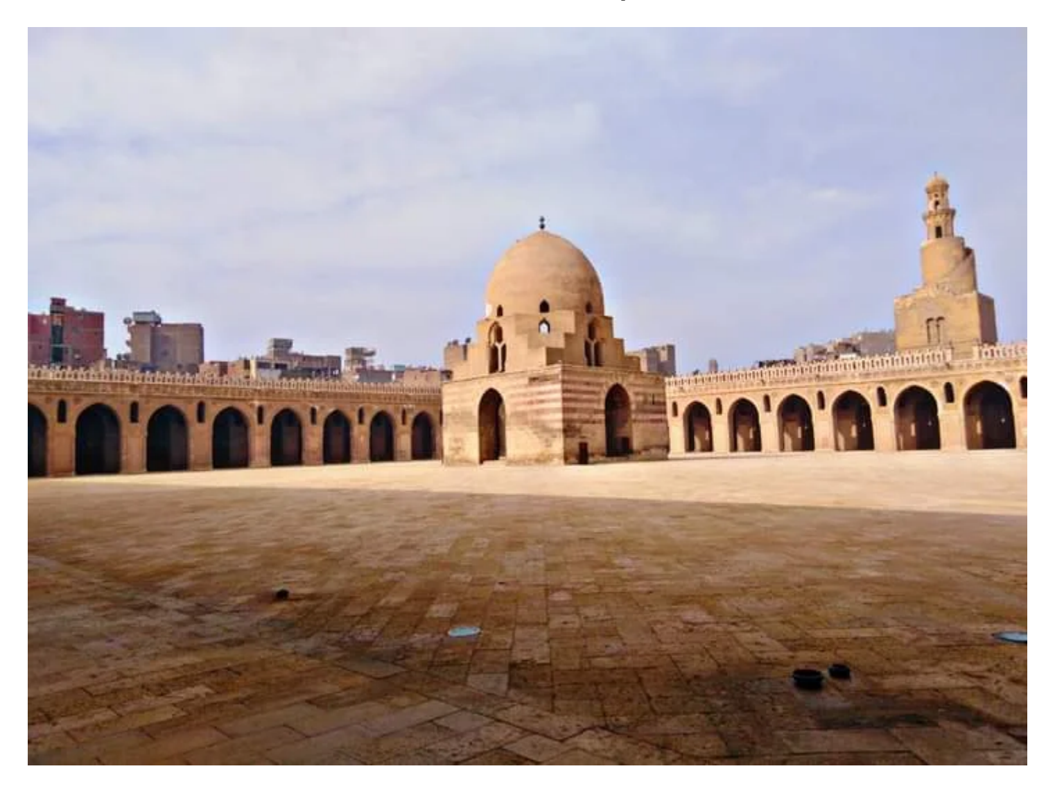
Day 7: Salah El-Din Citadel , Al Sultan Hassan & Ibn Tulun Mosqes