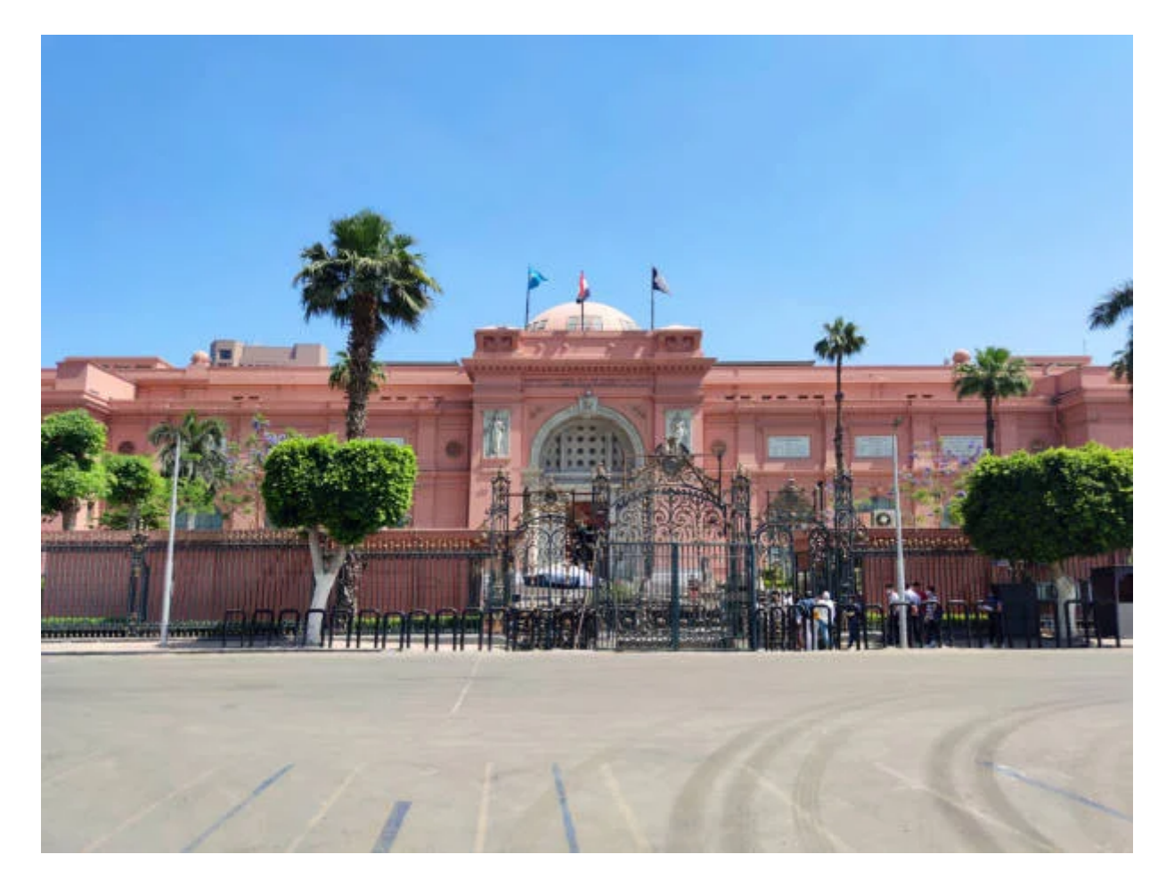
Day 6: Egyptian Museum , National Museum of Civilization , old Cairo

When you arrive at Aswan Airport, our representative will receive you and welcome you. After that, you will go to the Temple of the Philae and the Unfinished Obelisk . The next day, you will go to Kom Ombo and Edfu , in addition to the Karnak Temple and Luxor . When you return to Cairo, you will go to the Khan El-Khalili Market to buy souvenirs for your friends. The next day, you will go to the Pyramids of Giza and Memphis and the Step Pyramid of Saqqara . The next day, you will go to the Egyptian Museum and then the Museum of Civilization . You will learn about the Coptic civilization and the Hanging Church . The next day, you will go to the Citadel of Saladin , the