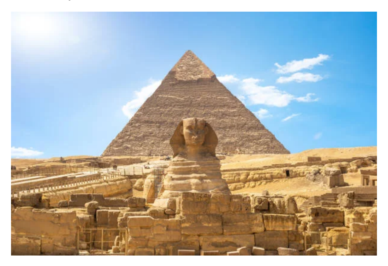
Day 2: Memphis, Sakkara, and Pyramids Tour