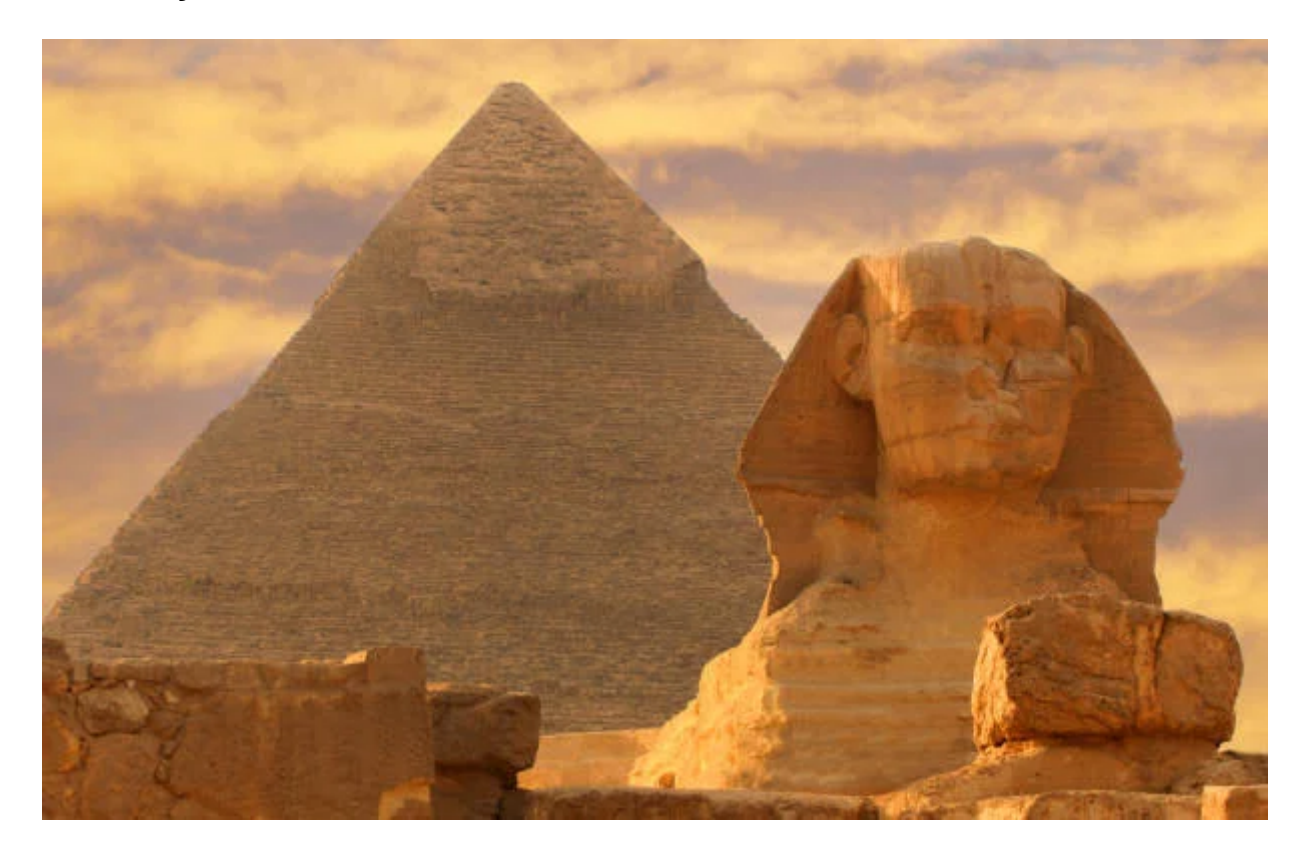
Day 2: Memphis, Sakkara, Pyramids Tour