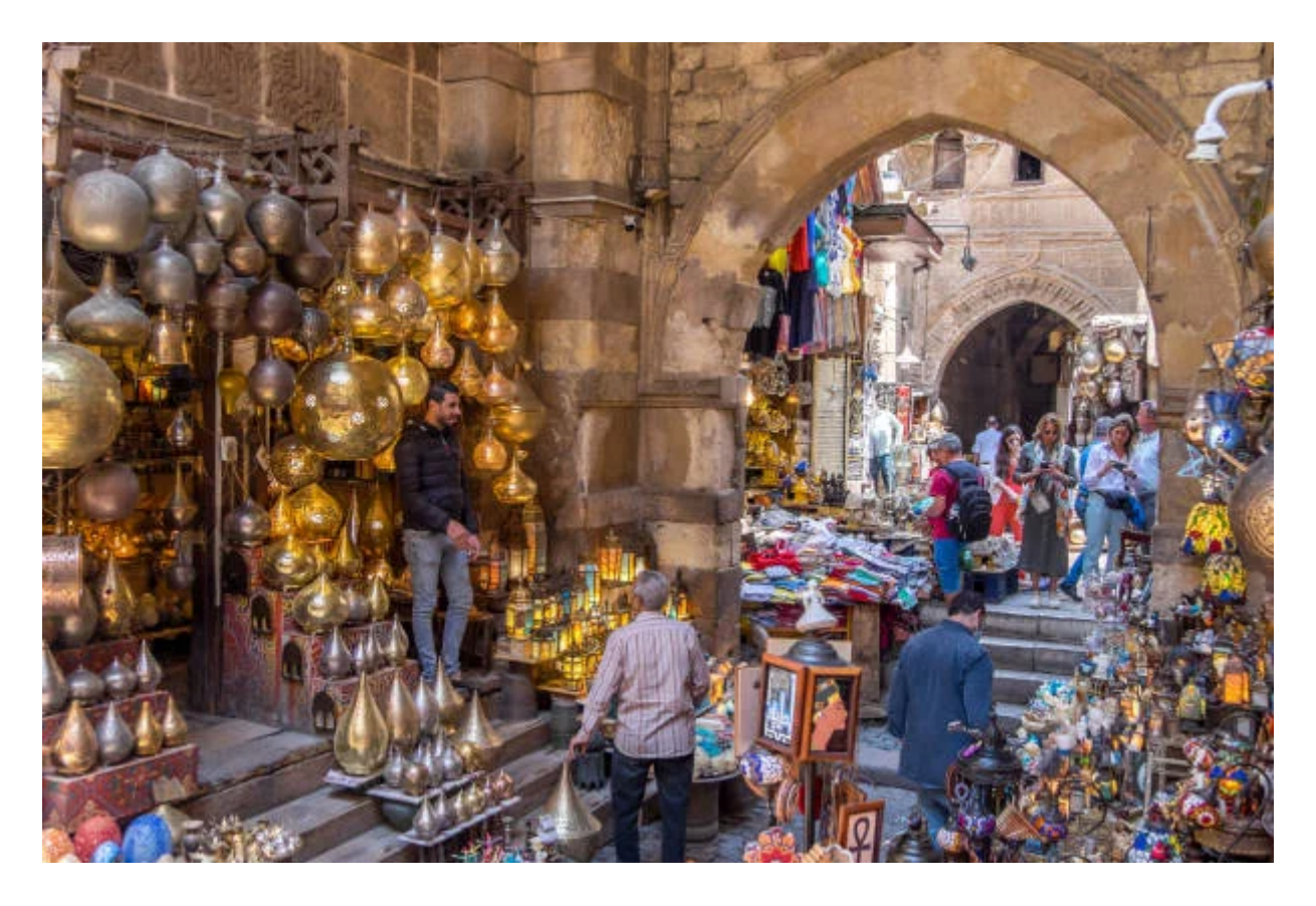
Day 6: khan El-Khalili & Salah El Din Citadel

When you arrive at the airport, you will go to the Pyramids of Giza , the Memphis area, and the Saqqara ruins area. The next day, you will go to the citadel and then to Kom el-Shoqafa . When you return to Cairo, you will go to the Egyptian Museum , the Museum of National Egyptian Civilization , the Hanging Church , and the Jewish Temple , in addition to the Egyptian Museum . The next day, you will go to the Egyptian Museum . You will go to Fayoum , the village of Tunis , and the Wadi El-Hitan Reserve. The next day, you will go to buy souvenirs and visit the Citadel of Saladin . The next day, after eating breakfast, our representative will take you to the airport to return to your country again.