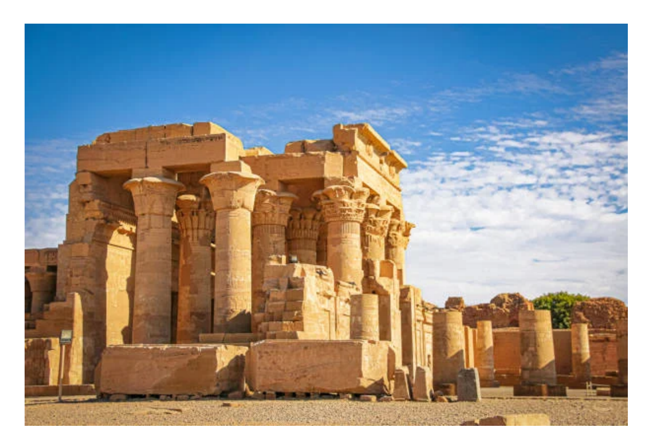
Day 2: Kom Ombo