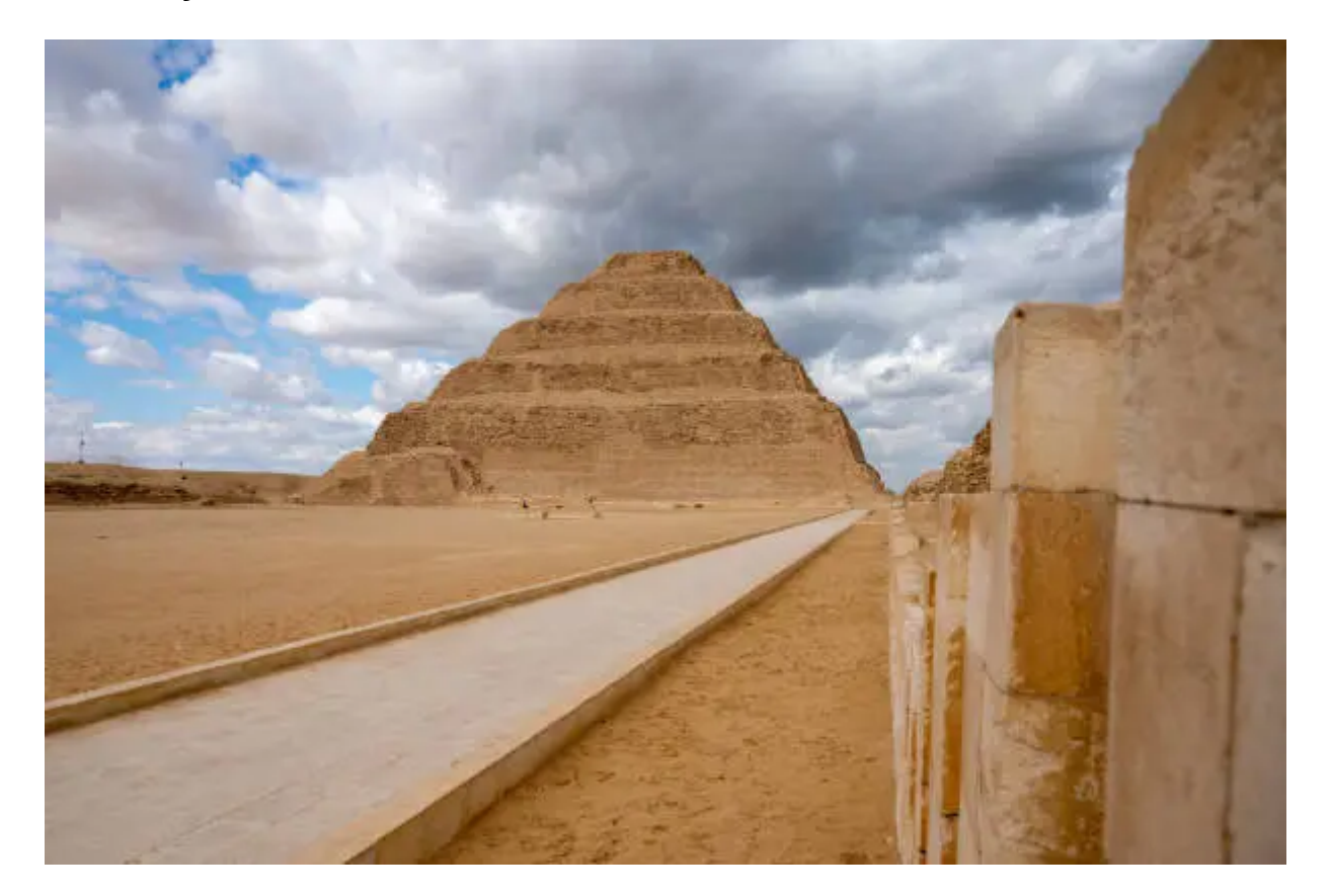
Day 5: Memphis, Sakkara, Pyramids Tour