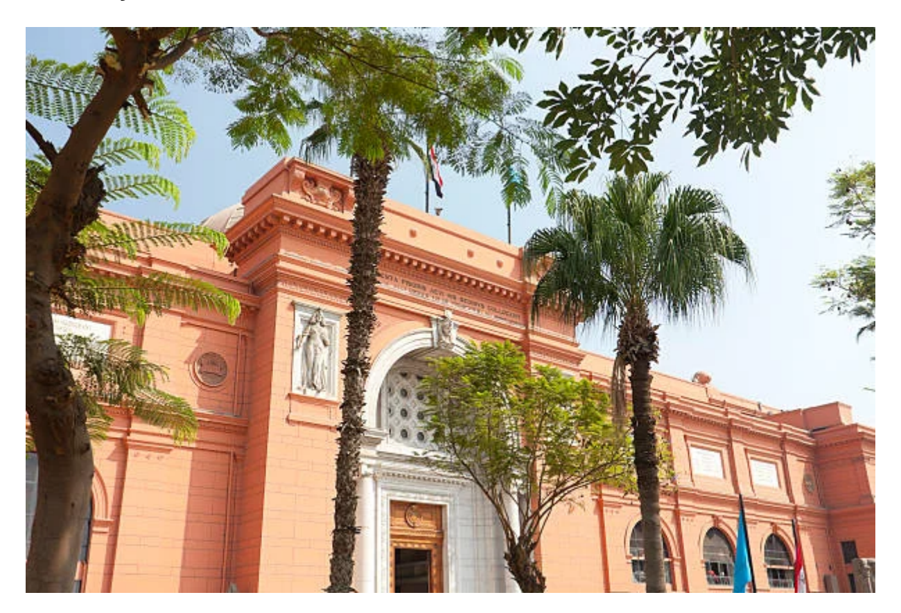
Day 2: Memphis, Sakkara, Pyramids Tour