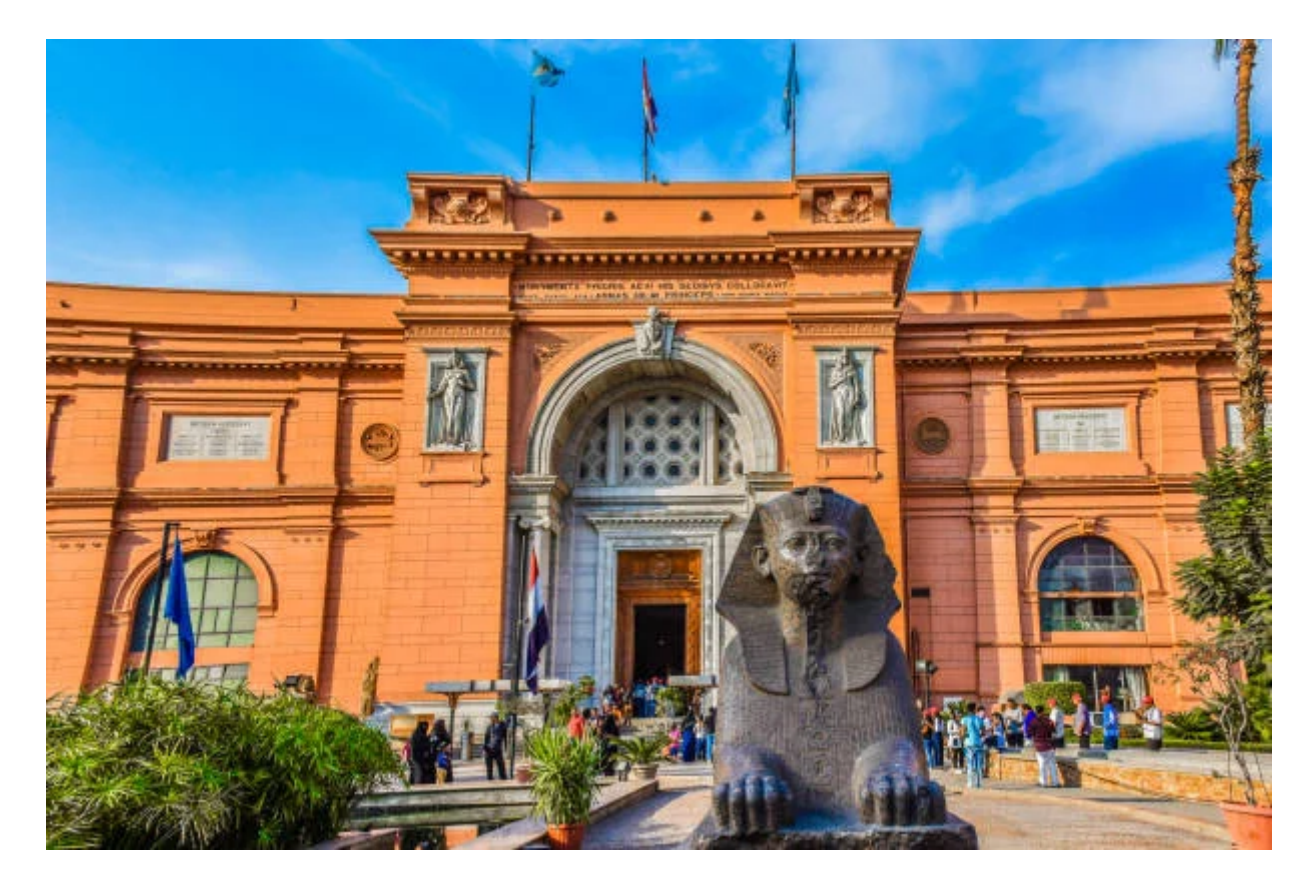
Day 3: Egyptian Museum , National Museum of Civilization , old Cairo