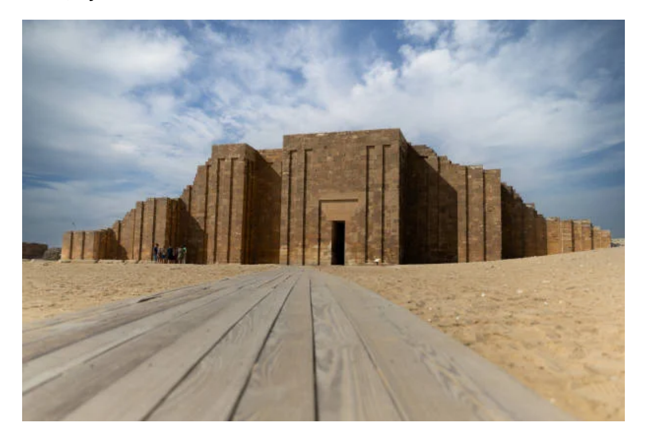
Day 2: Memphis, Sakkara, Pyramids Tour