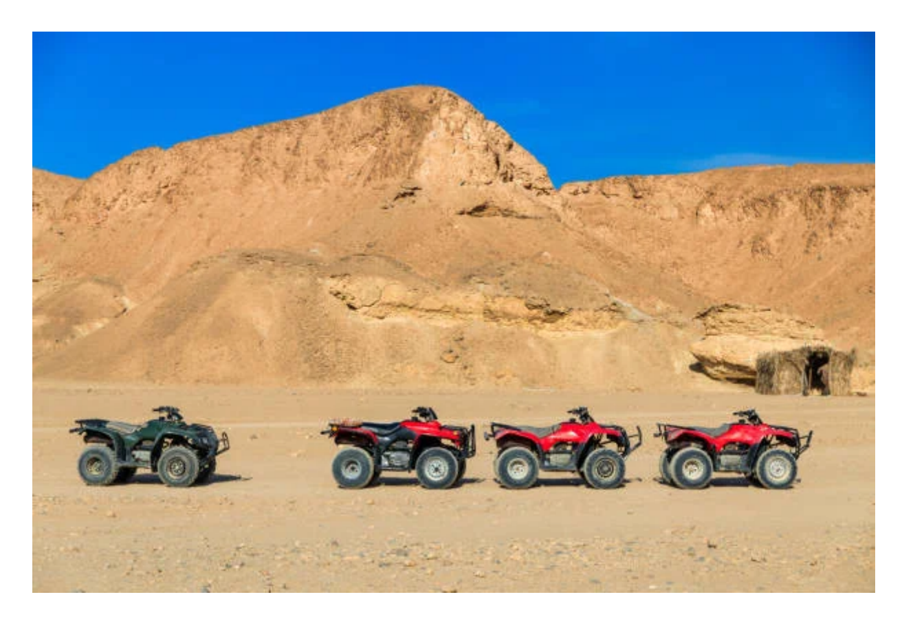
Day 3: Safari Tour

Once you arrive at Cairo Airport, our representative will receive and welcome you, and then you will travel to Marsa Alam . When you arrive at the airport, our representative will be waiting for you. He will take you in an air-conditioned car to go to your hotel to relax.