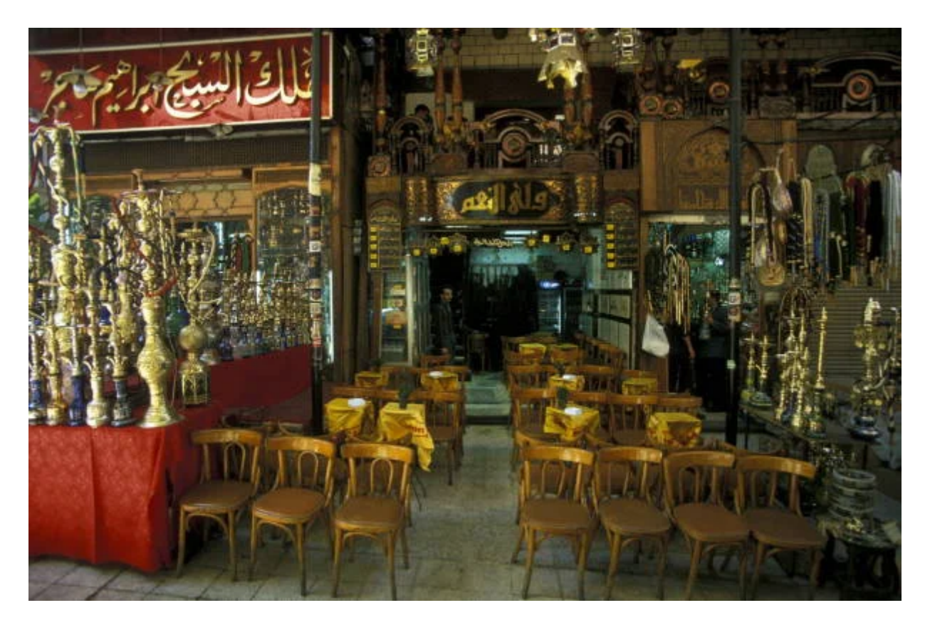
Day 5: Khan el-Khalili & Salah El-Din Citadel

When you get to the airport, we will transport you to our representative in an air-conditioned car so you can rest after a long day of travel to your Cairo hotel. The next morning, you may wake up after a peaceful night at our hotel. You will see Memphis , the three pyramids of Saqqara , and the Giza pyramids with an expert tour after breakfast. Once this trip is over, we'll transport you to a nearby restaurant for lunch before dropping you off at your hotel. The next day, we will drive you to Alexandria to see the Qaitbay Citadel , where the Mamluk ruler had taken refuge in the late Mamluk era, which is one of the Alexandrian Cemeteries ; in the evening, head back to the Cairo hotel to get ready for your visit to the Egyptian Museum , which has an extensive collection of antiquated artifacts; after that, head to the National Museum of Civilization , which leads to the church and the Jewish Temple , where you can learn about the nursery. After seeing the Coptic Museum , Coptic Plus goes to the Salah al-Din fortress and Khan Khalili Bazar , where leather, incense, and perfume are stored,