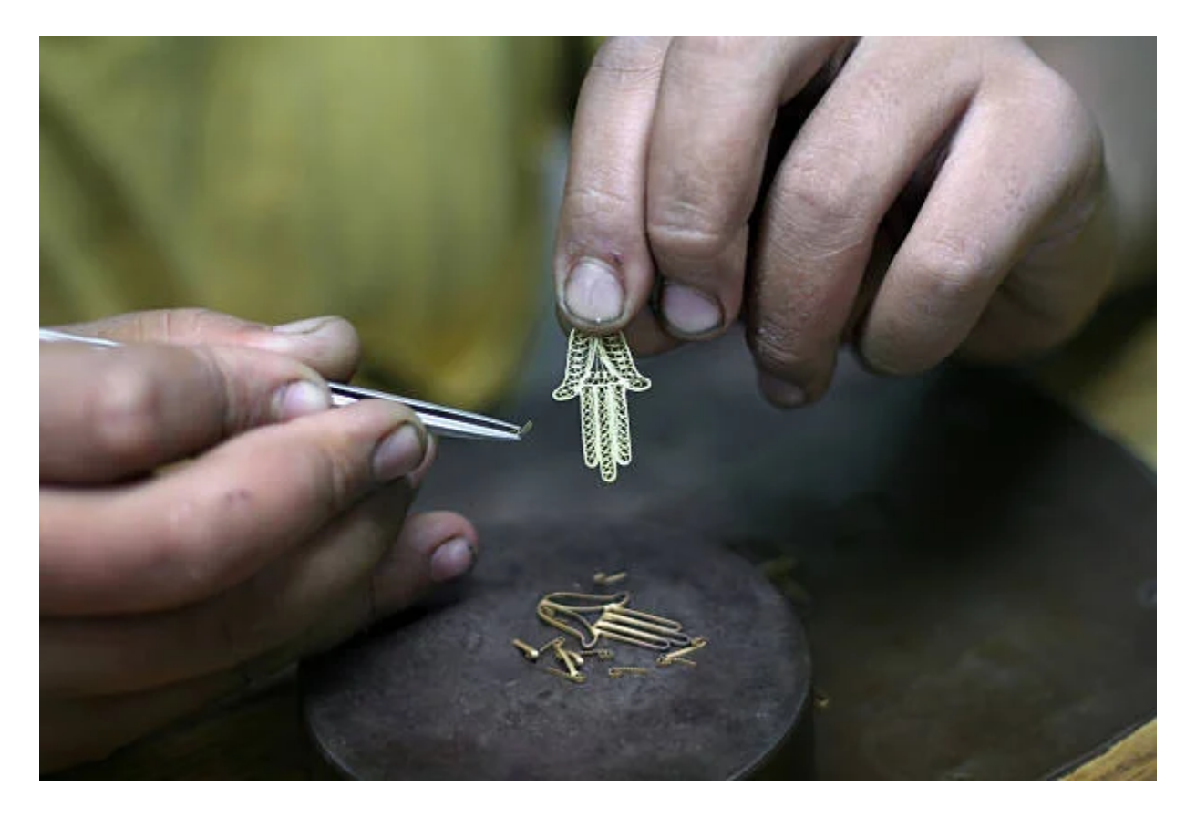
Day 3: Egyptian Museum ,Salah El Din Citadel , Khan El Khalili

Once you arrive at the airport, our representative will receive and welcome you. Then you will go with him to the Pyramids of Giza , Saqqara , and Memphis . The next day, you will go to the Egyptian Museum , and then you will go to Salah El- Din Citadel and Khan El Khalili Bazar .