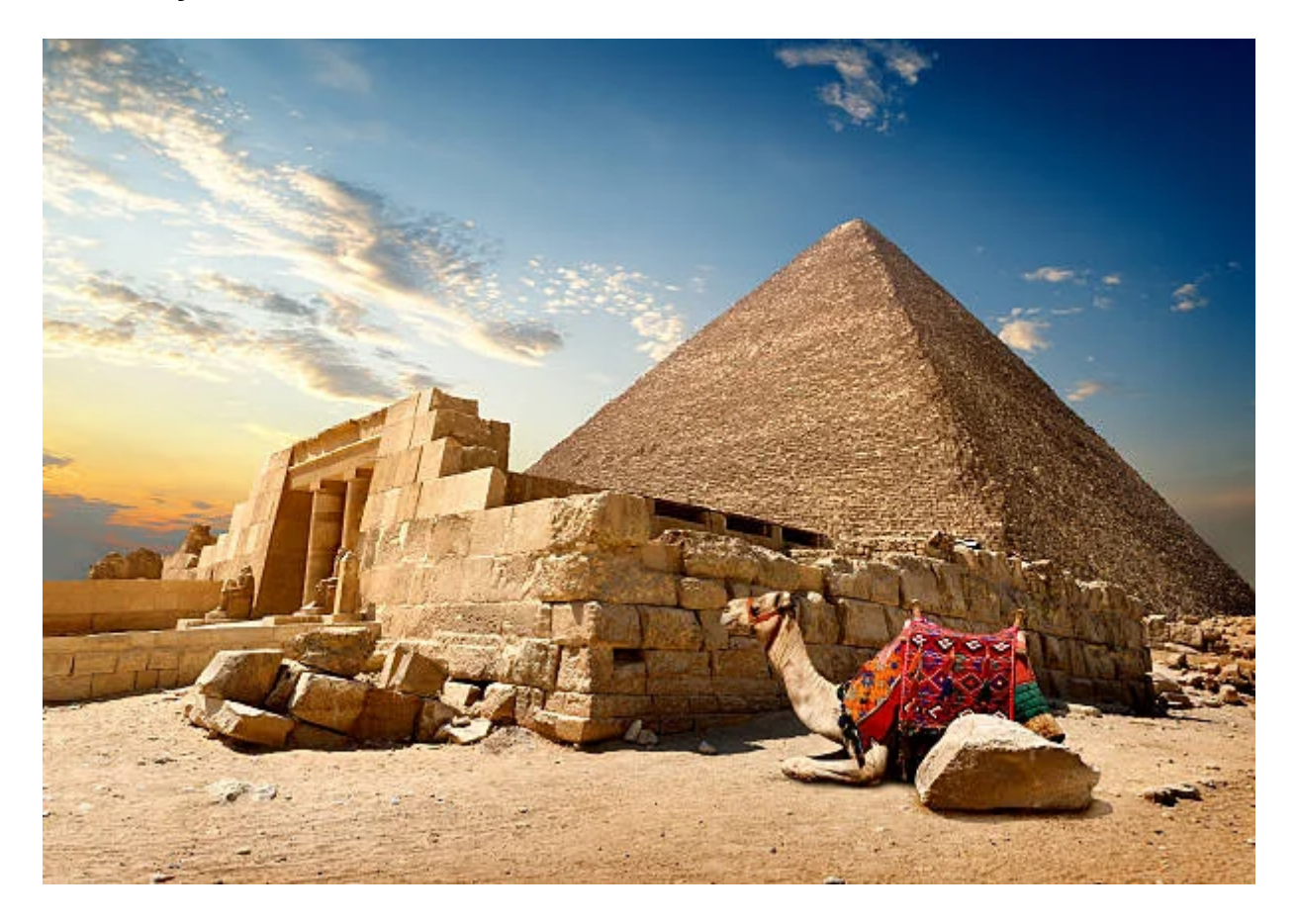
Day 2: Memphis , Sakkara , Pyramids Tour

Once you arrive at the airport, our representative will receive and welcome you. Then you will go with him to the Pyramids of Giza , Saqqara , and Memphis . The next day, you will go to the Egyptian Museum , and then you will go to Salah El- Din Citadel and Khan El Khalili Bazar .