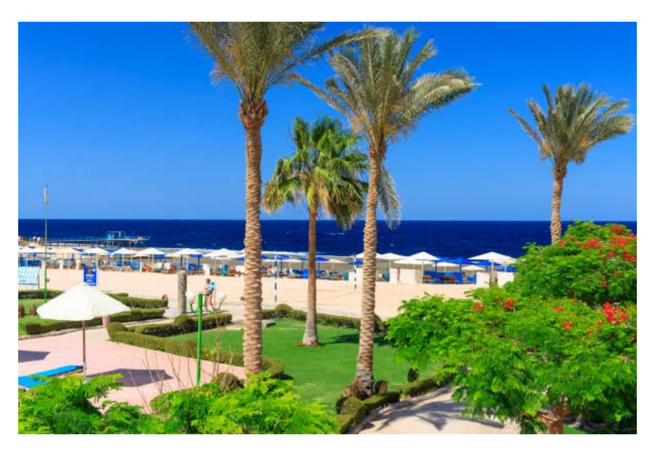
Day 2: Fly to Marsa Alam