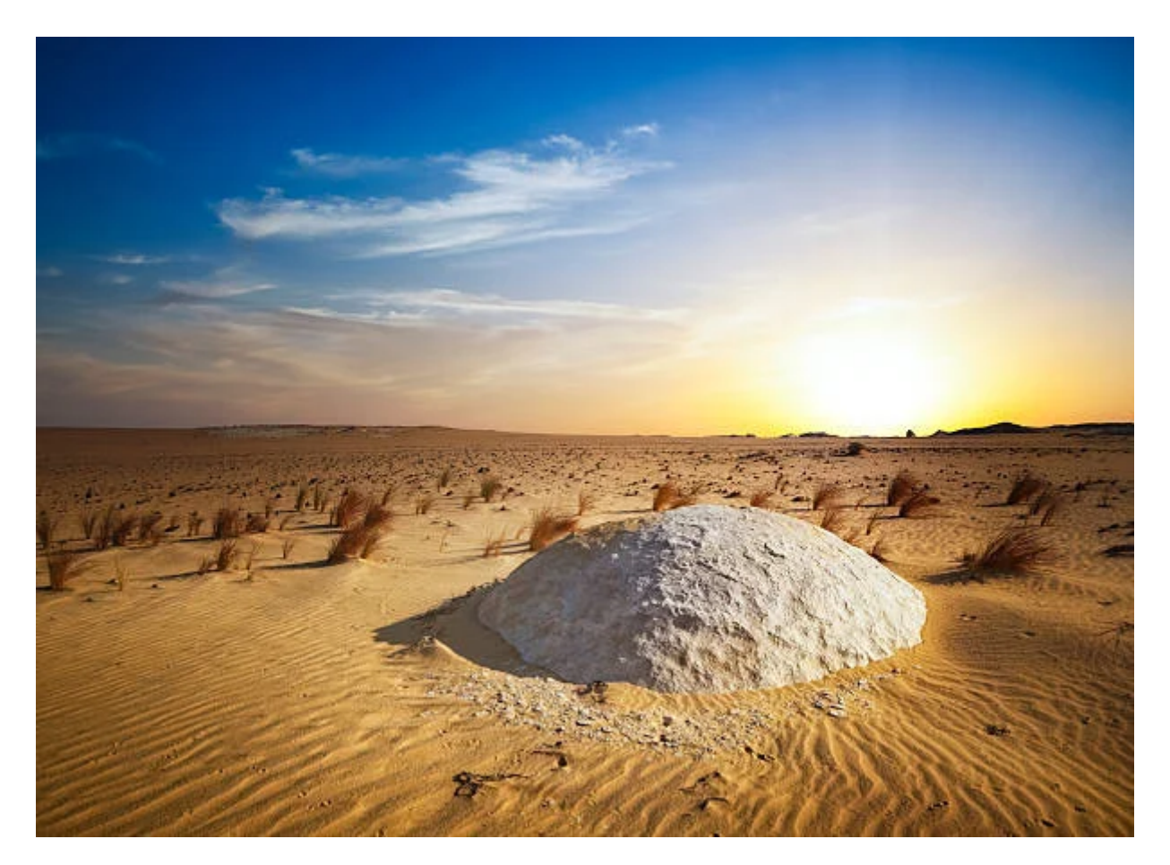
Day 1: Cairo- White Desert

You will go on a four-hour trip into the white desert on After about 350 km, you will stop to have lunch and some refreshments, also known as the jewel of the desert, because it is a hill of crystal-like crystals where you can watch suitable exhilarating when the light hits it, then it will be used in horses in the desert and dinner in the camp, but enjoy watching the stars, and the next day you can enjoy a full day.