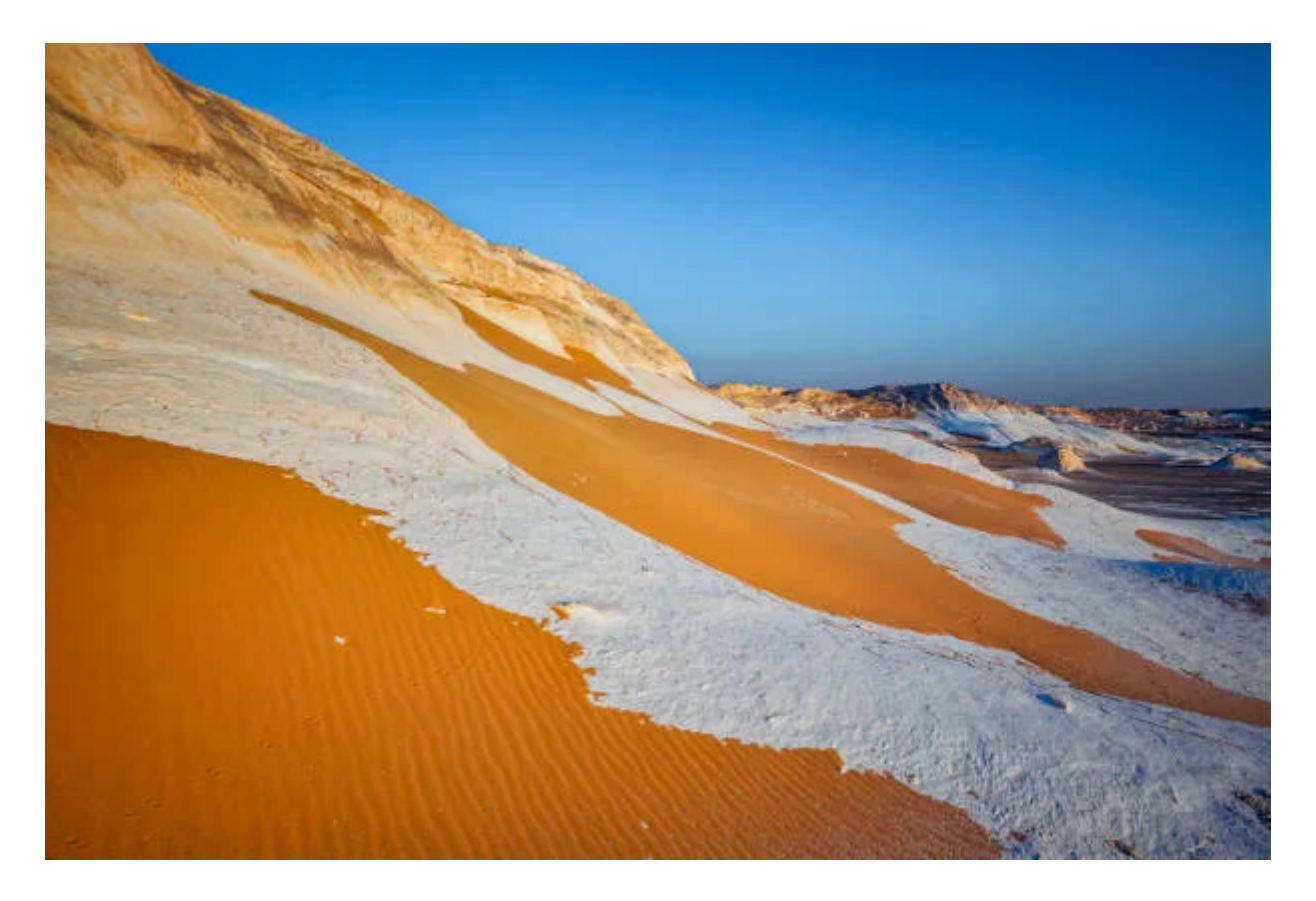
Day 1: Cairo- White Desert

You will go on a four-hour trip into the white desert on After about 350 km, you will stop to have lunch and some refreshments, also known as the jewel of the desert, because it is a hill of crystal-like crystals where you can watch suitable exhilarating when the light hits it, then it will be used in horses in the desert and dinner in the camp, but enjoy watching the stars, and the next day you can enjoy a full day.