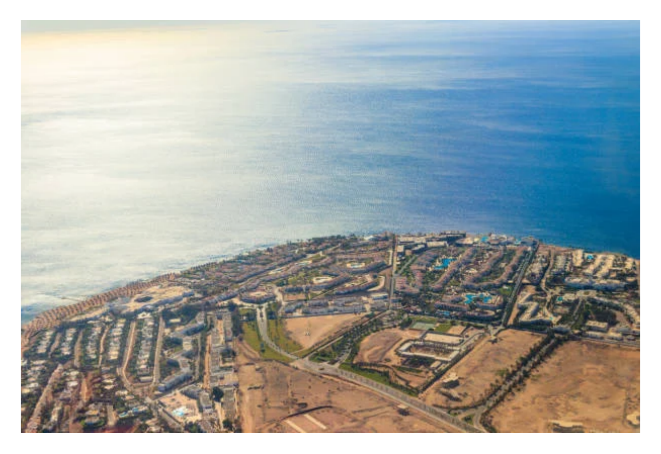
Day 2: Fly to Sharm El-Sheik