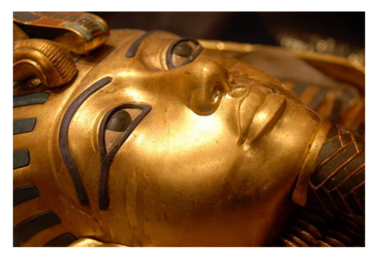
Day 3: Egyptian Museum, National Museum Of Civilization, Old Cairo