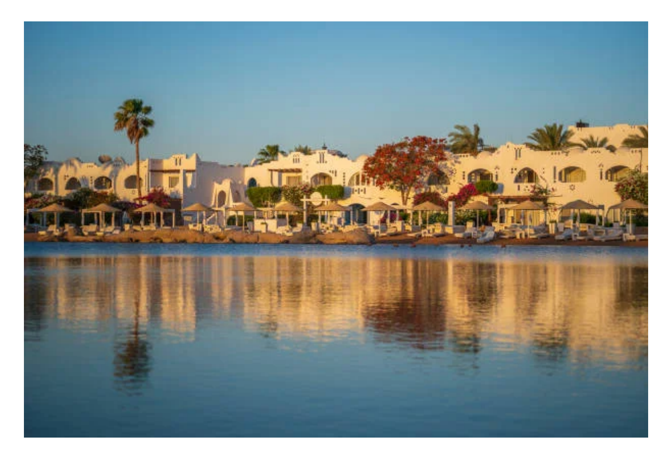
Day 2: Fly to Sharm El-Sheikh