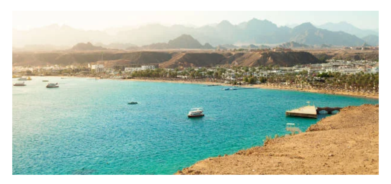
Day 2: Fly to Sharm El-Sheikh