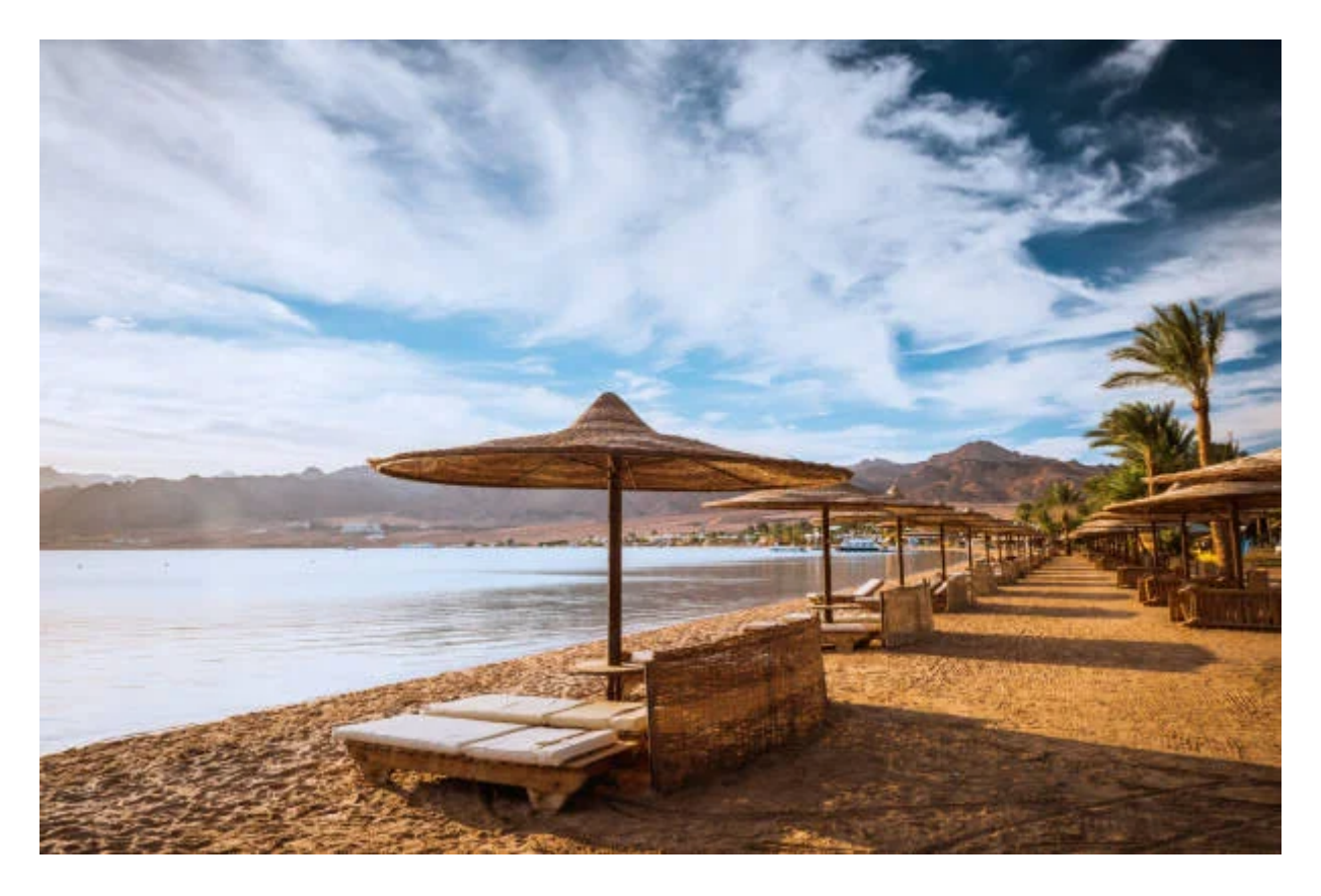
Day 2: Fly to Hurghada