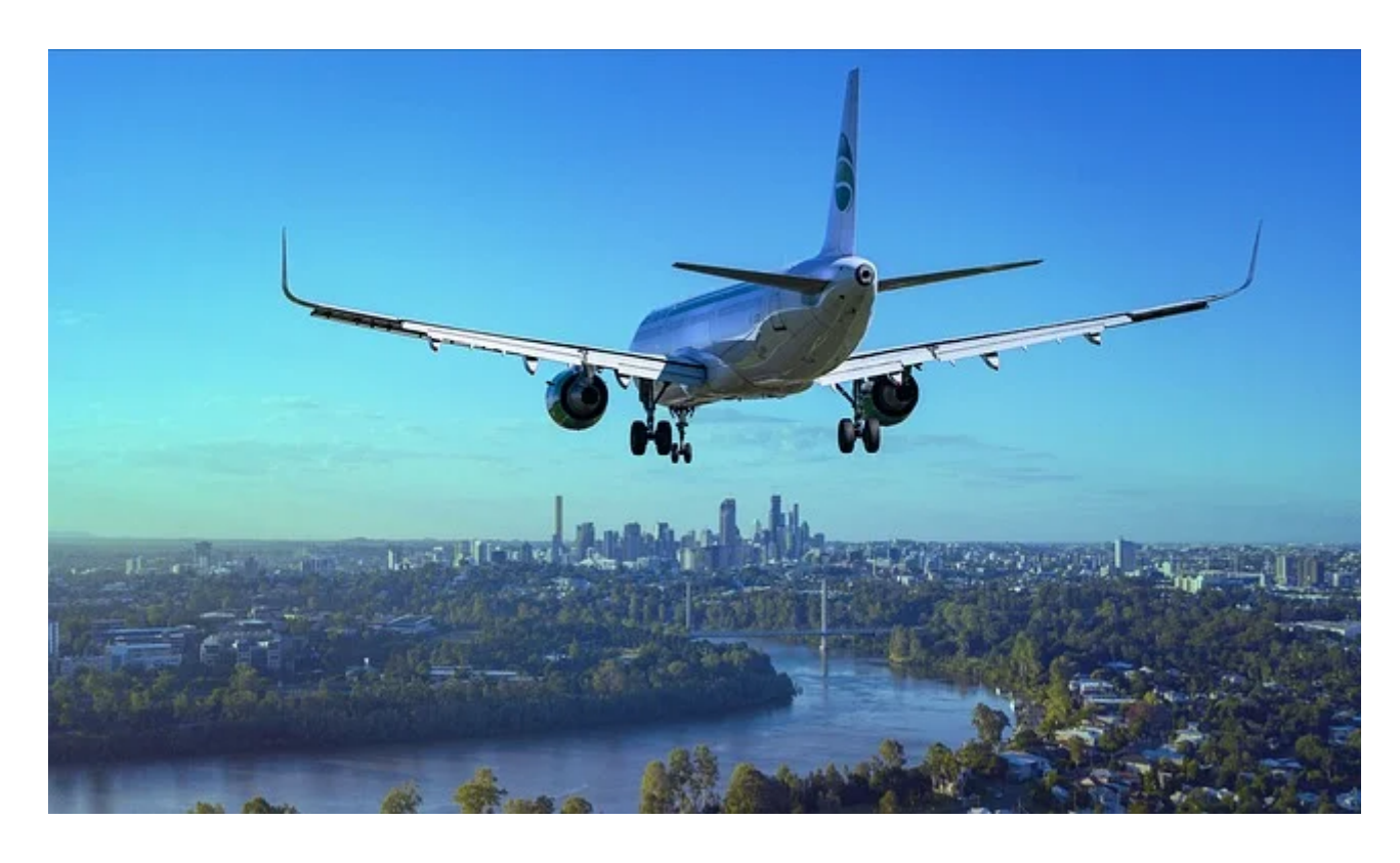
Day 1: Arrival

When you arrive at Cairo airport, our representative will take you to the hotel and the next day you will go to the Pyramids of Giza , then Saqqara , then Memphis and have lunch at a local restaurant