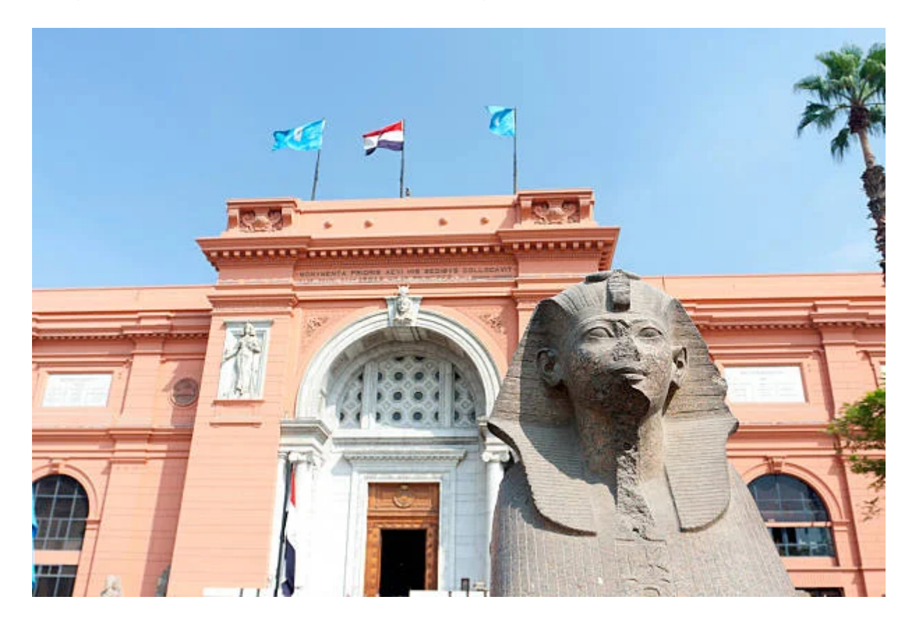
Day 4: Egyptian Museum, National Museum of Civilization, Old Cairo