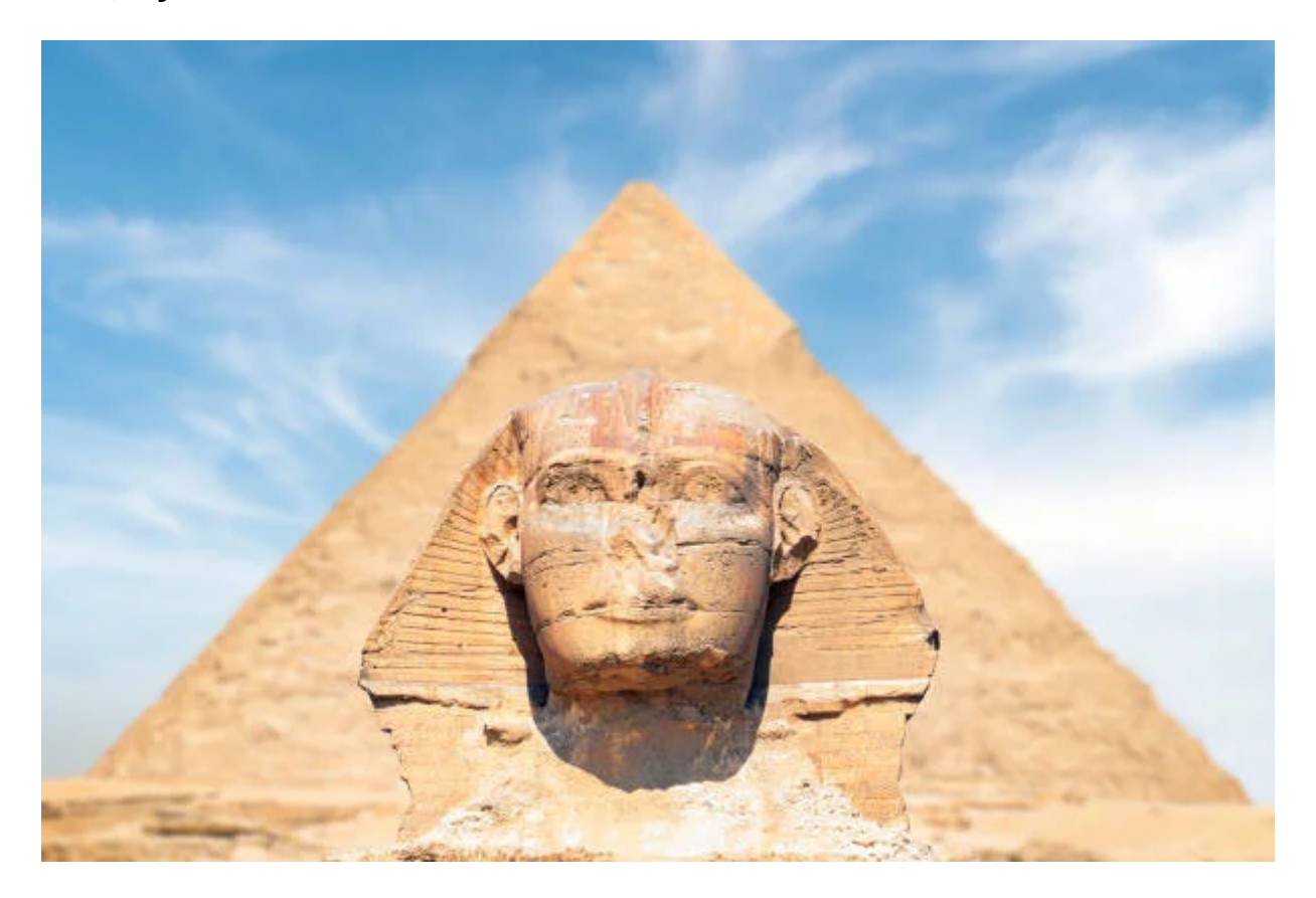
Day 2: Memphis, Sakkara, Pyramids Tour