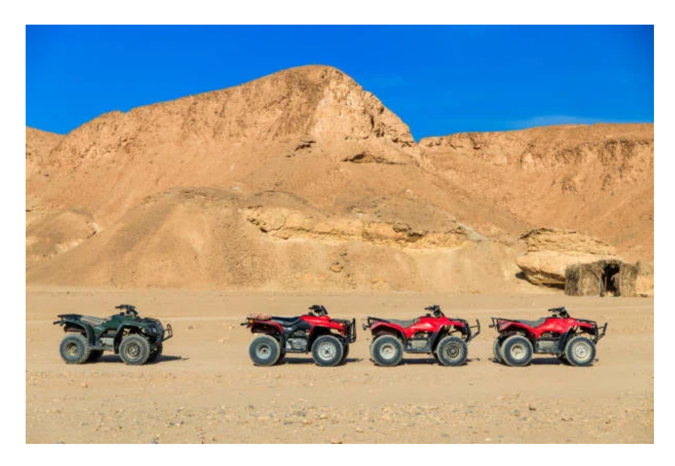
Day 3: Safari Tour

After our representative meets and greets you at the Cairo Airport, you will travel to Mars Alam. Our agent will be there to greet you when you get to the airport. He will drive you to your lodging so you can unwind in a stylish vehicle. There's much to do after lunch, including diving, snorkeling, surfing, and lounging on the beach. Savor the tranquility, beautiful weather, charming beach, and crystal-clear blue water. In addition, you can purchase presents for your loved ones and take a guided tour of the city's streets with one of our agents. The following day, our agent will transport you to the airport so you may catch a flight home after breakfast at your hotel.