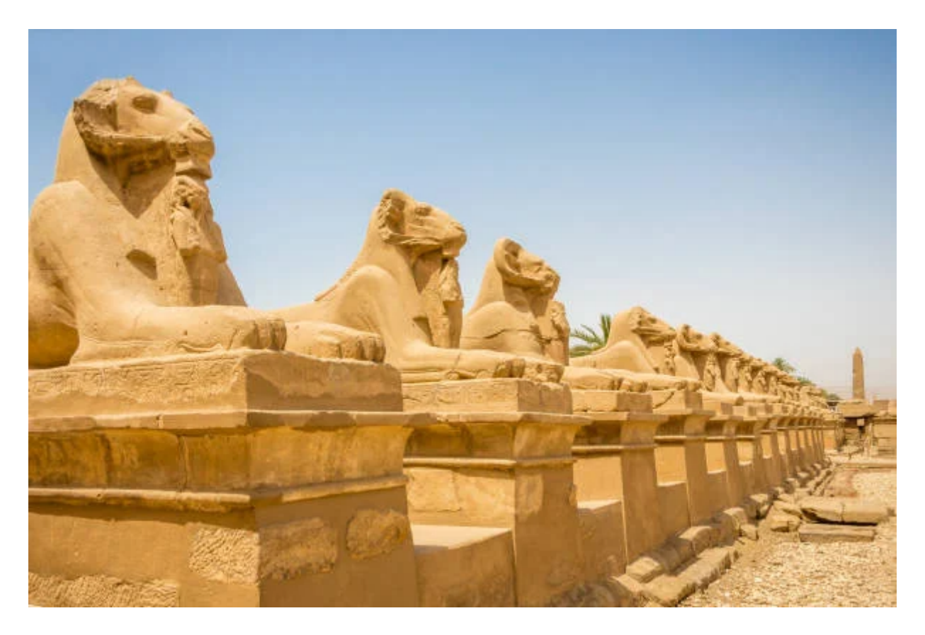
Day 1: Check in , East Bank

When you arrive at the airport, our representative will visit the Luxor Temple after visiting the Karnak Temple . Beginning the next day, you and our representative will tour the Temple of Queen Hatshepsut and the Valley of the Kings ,