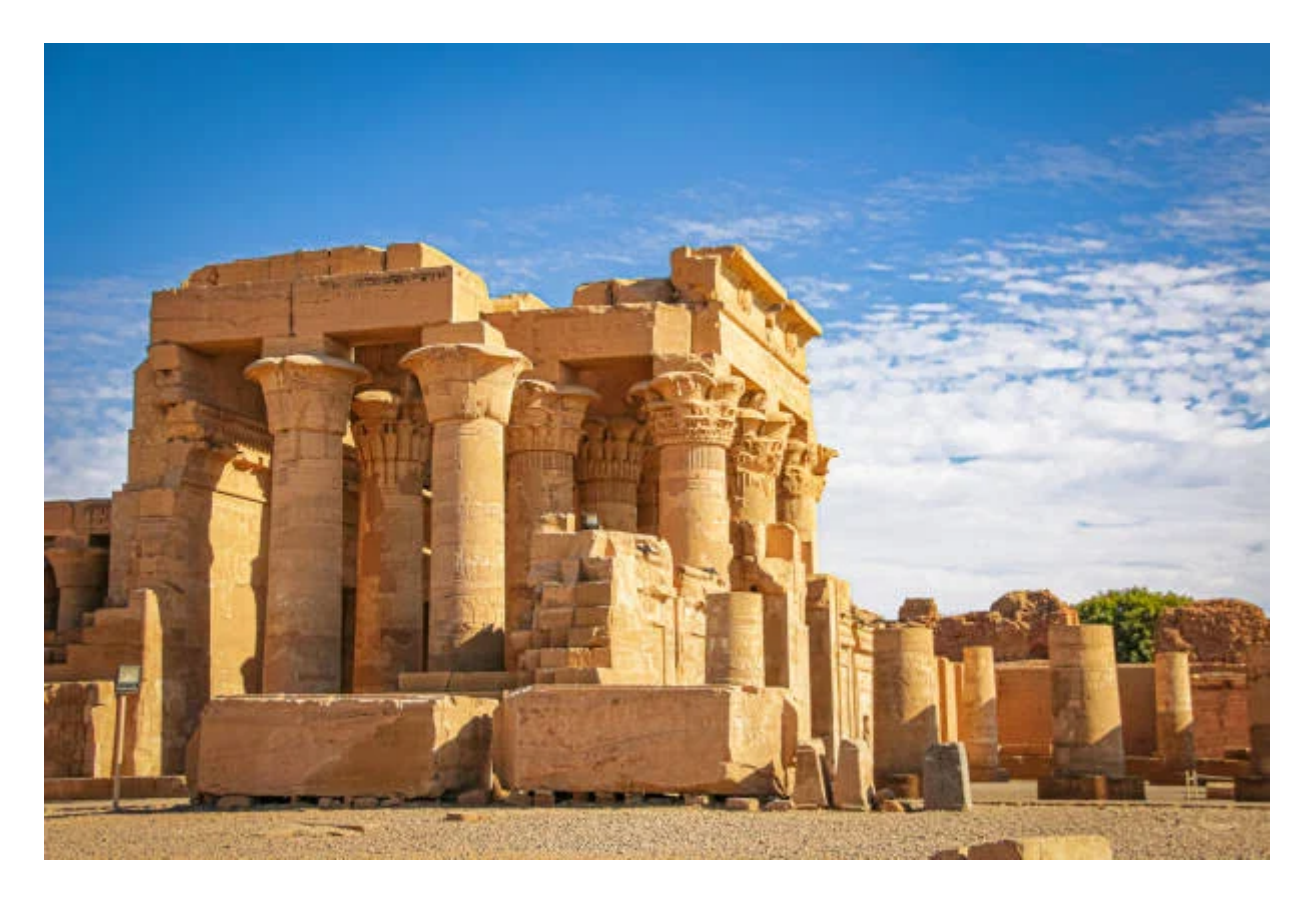
Day 3: Edfu , Kom Ombo

When you arrive at the airport, our representative will visit the Luxor Temple after visiting the Karnak Temple . Beginning the next day, you and our representative will tour the Temple of Queen Hatshepsut and the Valley of the Kings ,