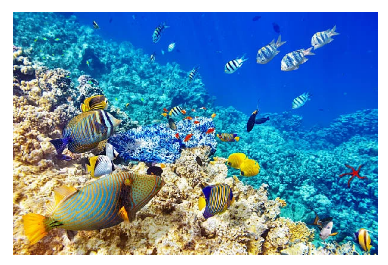
Day 2: Shram El- Sheikh

You will fly to Sharm EI- Sheikh once our agent meets and greets you at the Cairo Airport. When you arrive at the airport, our agent will be there to welcome you. He will transport you to your accommodation so you can relax in a chic car. There's no shortage of things to do after lunch, like surfing, diving, snorkeling, and beach lazing. Savor the peace, lovely weather, quaint beach, and glistening blue water. You can also buy gifts for the people you care about and go on a guided walking tour of the city's streets with one of our agents. Our agent will take you to the airport the next day, so you may take a flight home after breakfast at your hotel.