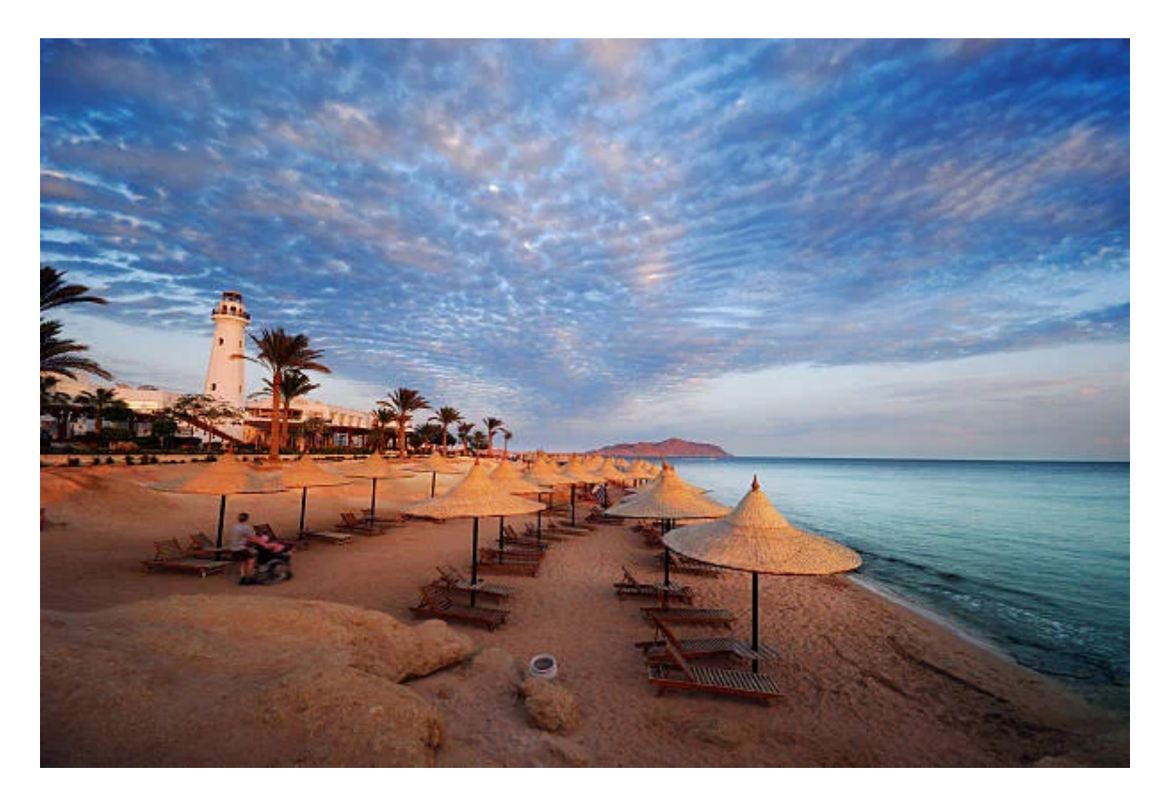
Day 1: Arrival

You will fly to Sharm EI- Sheikh once our agent meets and greets you at the Cairo Airport. When you arrive at the airport, our agent will be there to welcome you. He will transport you to your accommodation so you can relax in a chic car. There's no shortage of things to do after lunch, like surfing, diving, snorkeling, and beach lazing. Savor the peace, lovely weather, quaint beach, and glistening blue water. You can also buy gifts for the people you care about and go on a guided walking tour of the city's streets with one of our agents. Our agent will take you to the airport the next day, so you may take a flight home after breakfast at your hotel.