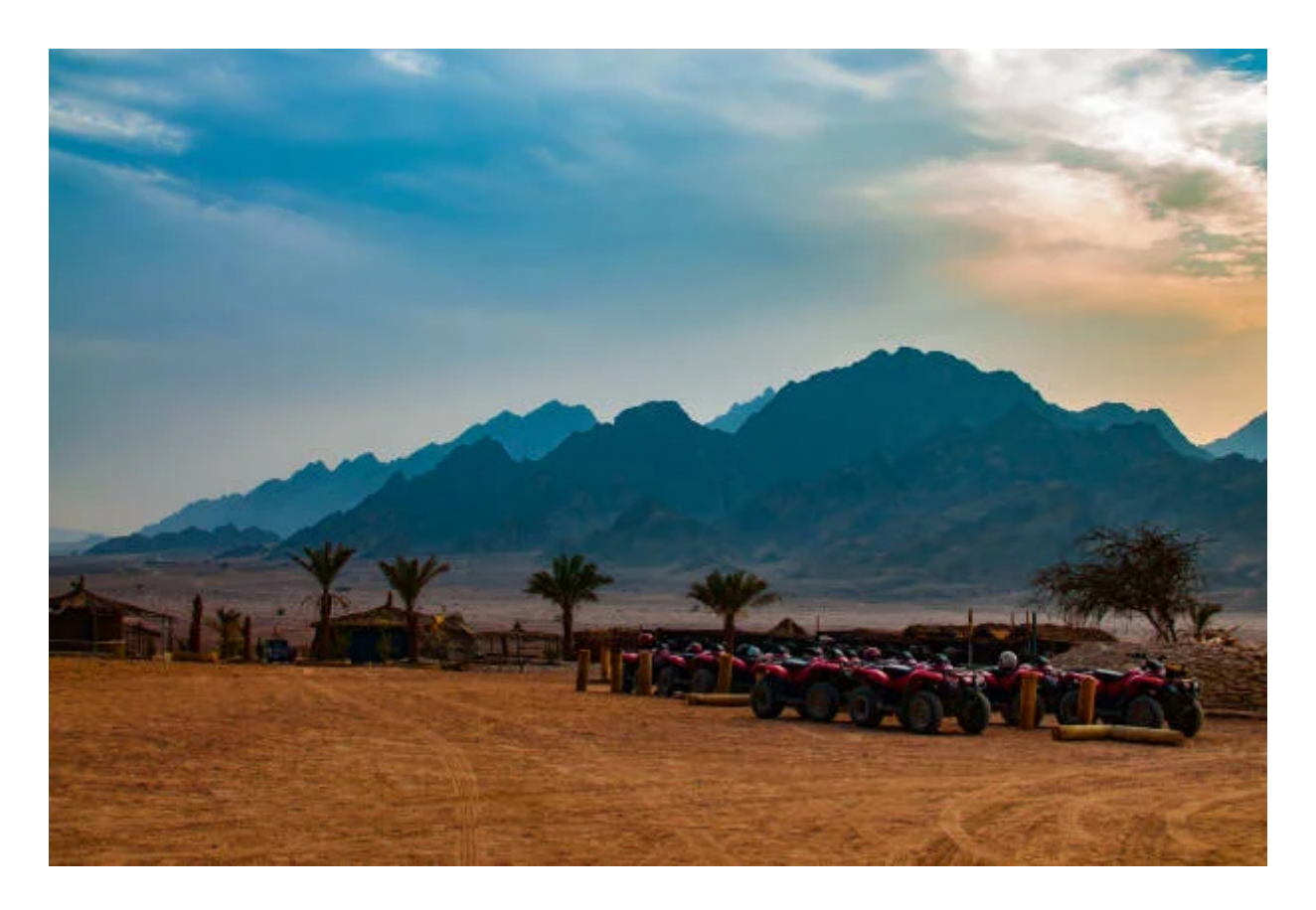
Day 3: Safari Tour

You will fly to Sharm EI- Sheikh once our agent meets and greets you at the Cairo Airport. When you arrive at the airport, our agent will be there to welcome you. He will transport you to your accommodation so you can relax in a chic car. There's no shortage of things to do after lunch, like surfing, diving, snorkeling, and beach lazing. Savor the peace, lovely weather, quaint beach, and glistening blue water. You can also buy gifts for the people you care about and go on a guided walking tour of the city's streets with one of our agents. Our agent will take you to the airport the next day, so you may take a flight home after breakfast at your hotel.