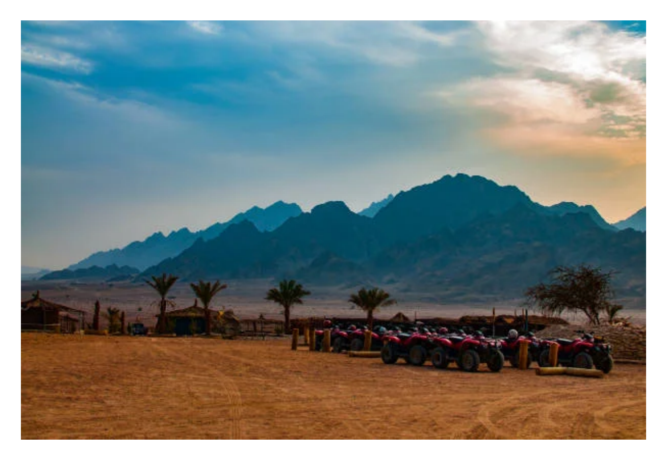
Day 2: Sharm El-Sheikh

After eating lunch, you can practice many activities, such as diving, watching coral reefs, surfing, and relaxing on the beach. Enjoy the bright sunshine, soft sand, clear blue water, and relaxation. You can also wander the city streets with our representative and buy souvenirs for friends and family. The next day, after eating breakfast at your hotel,