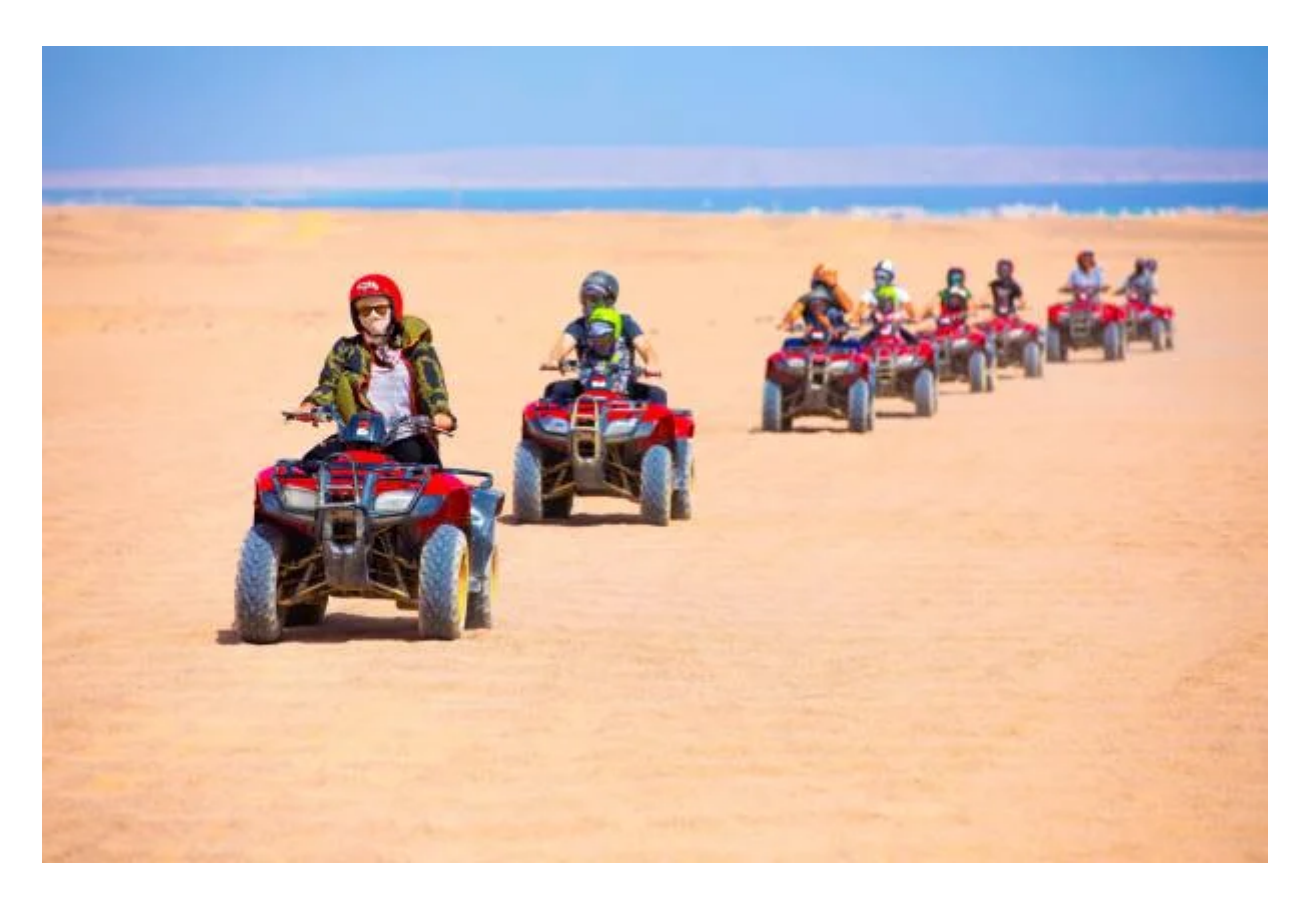
Day 3: Safari Tour

After eating lunch, you can practice many activities, such as diving, watching coral reefs, surfing, and relaxing on the beach. Enjoy the bright sunshine, soft sand, clear blue water, and relaxation. You can also wander the city streets with our representative and buy souvenirs for friends and family. The next day, after eating breakfast at your hotel,