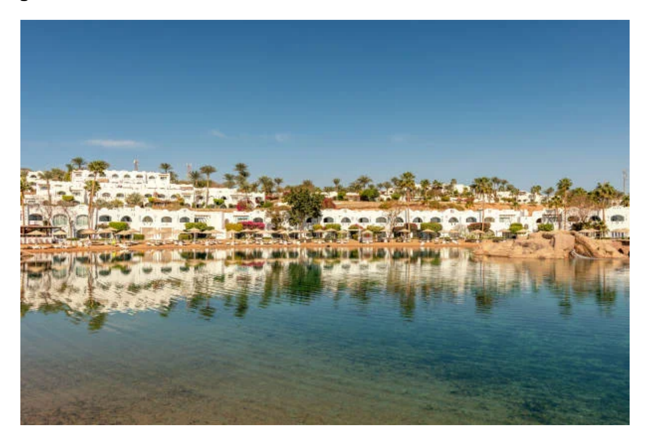
Day 2: Free Day, Hurghada

After eating lunch, you can practice many activities, such as diving, watching coral reefs, surfing, and relaxing on the beach. Enjoy the bright sunshine, soft sand, clear blue water, and relaxation. You can also wander the city streets with our representative and buy souvenirs for friends and family. The next day, after eating breakfast at your hotel,