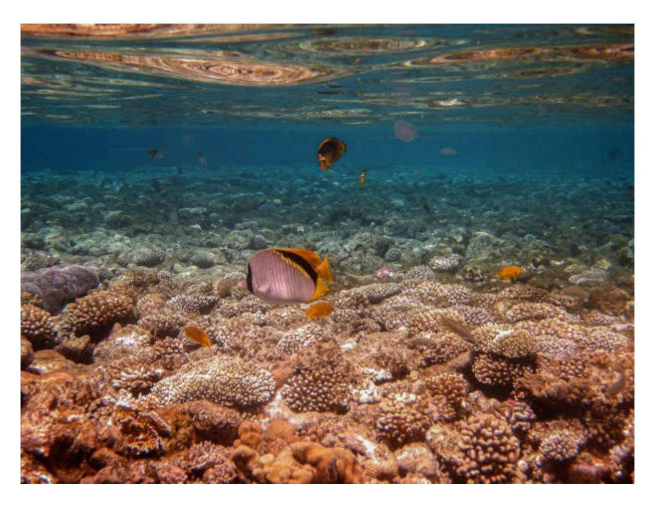
Day 1: Arrival

Once you arrive at Cairo Airport, our representative will receive and welcome you, and then you will travel to Hurghada . When you arrive at the airport, our representative will be waiting for you. He will take you in an air-conditioned car to go to your hotel to relax.