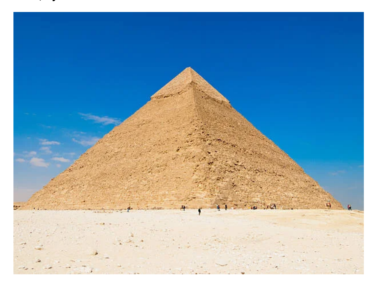
Day 2: Memphis, Sakkara, Pyramids Tour