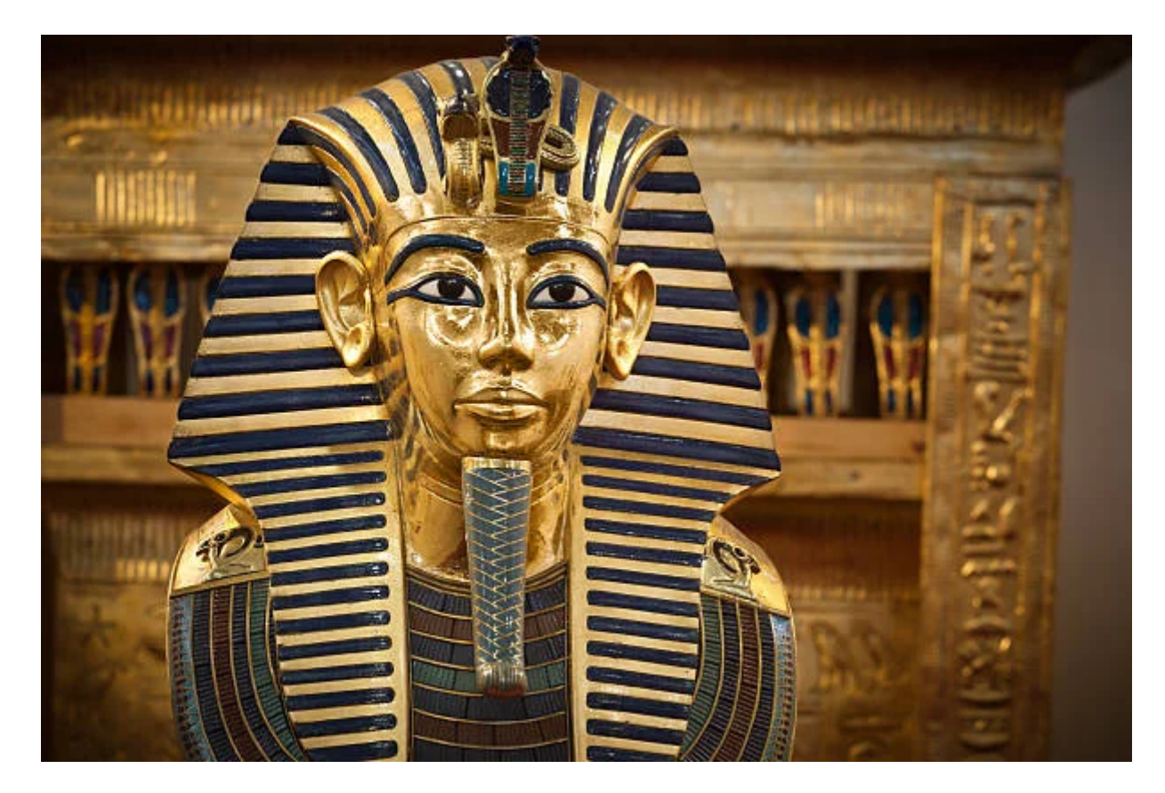
Day 3: Egyptian Museum , National Museum of Civilization , old Cairo