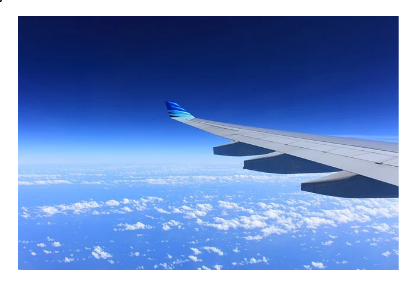
Day 8: Departure