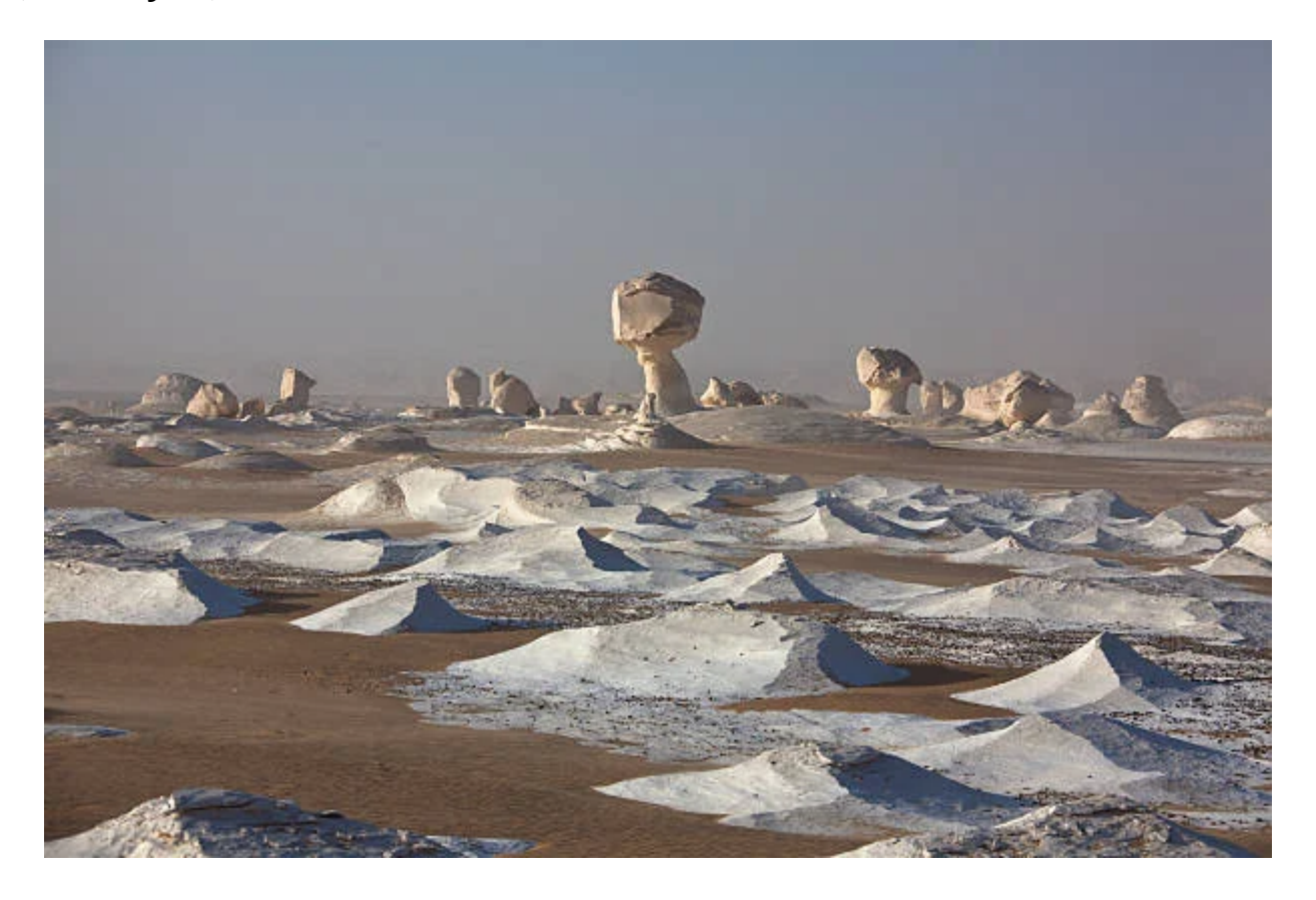
Day 6: white Desert , Baharyia , Cairo

you will go on a four-hour trip into the white desert on After about 350 km, you will stop to have lunch and some refreshments, also known as the jewel of the desert, because it is a hill of crystal-like crystals where you can watch suitable exhilarating when the light hits it, then it