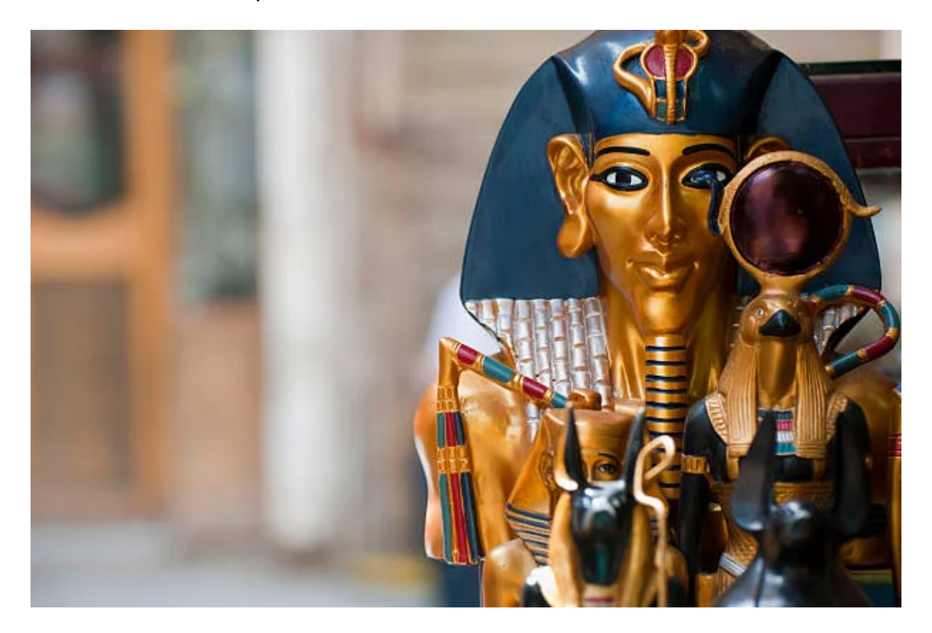
Day 7: National Museum of Civilization, khan el-khalili

you will go on a four-hour trip into the white desert on After about 350 km, you will stop to have lunch and some refreshments, also known as the jewel of the desert, because it is a hill of crystal-like crystals where you can watch suitable exhilarating when the light hits it, then it