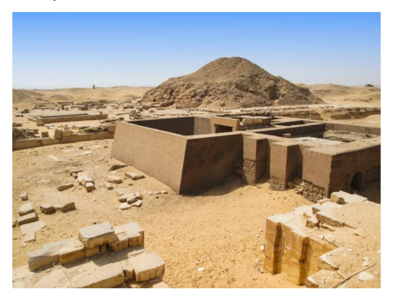
Day 2: Memphis, Sakkara, Pyramids Tour