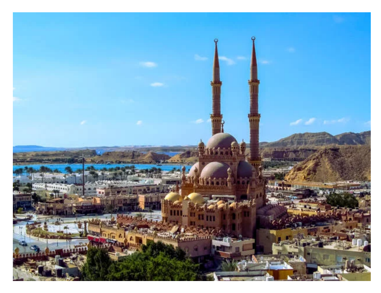
Day 6: Sharm El-Sheikh