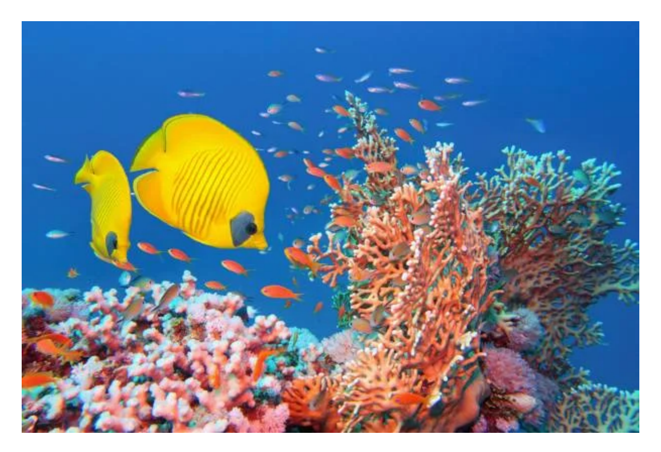
Day 4: Fly to Sharm El-Sheikh

then on to Sharm El-Sheikh to spend some lovely relaxing time by the Sea Mediterranean.. When the skies are clear, you can enjoy many activities, including water skiing, diving, dolphin watching and more When you return to Cairo,