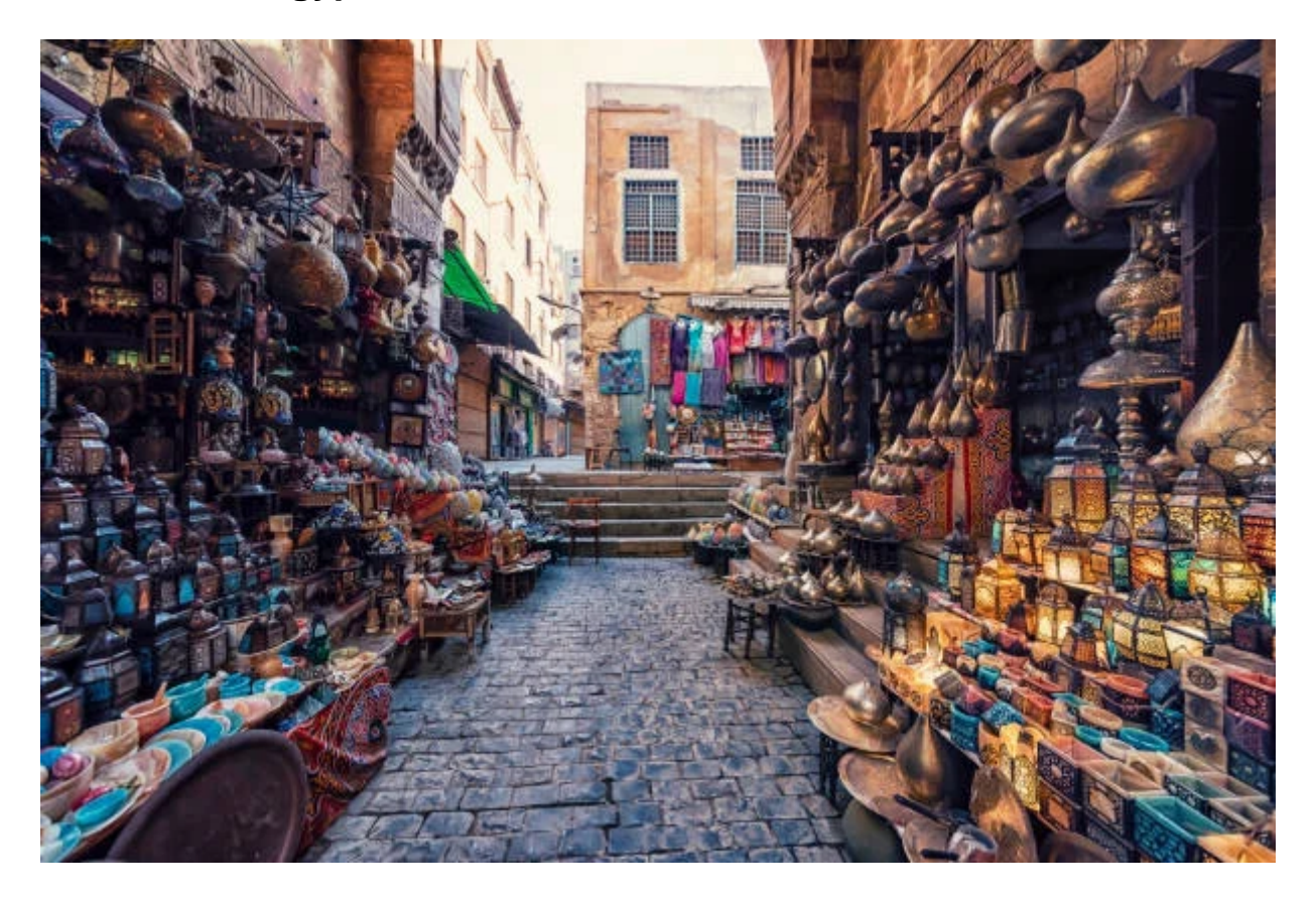
Day 7: Fly back to Cairo, National Egyptian Civilization, Khan El Khalili

then on to Sharm El-Sheikh to spend some lovely relaxing time by the Sea Mediterranean.. When the skies are clear, you can enjoy many activities, including water skiing, diving, dolphin watching and more When you return to Cairo,