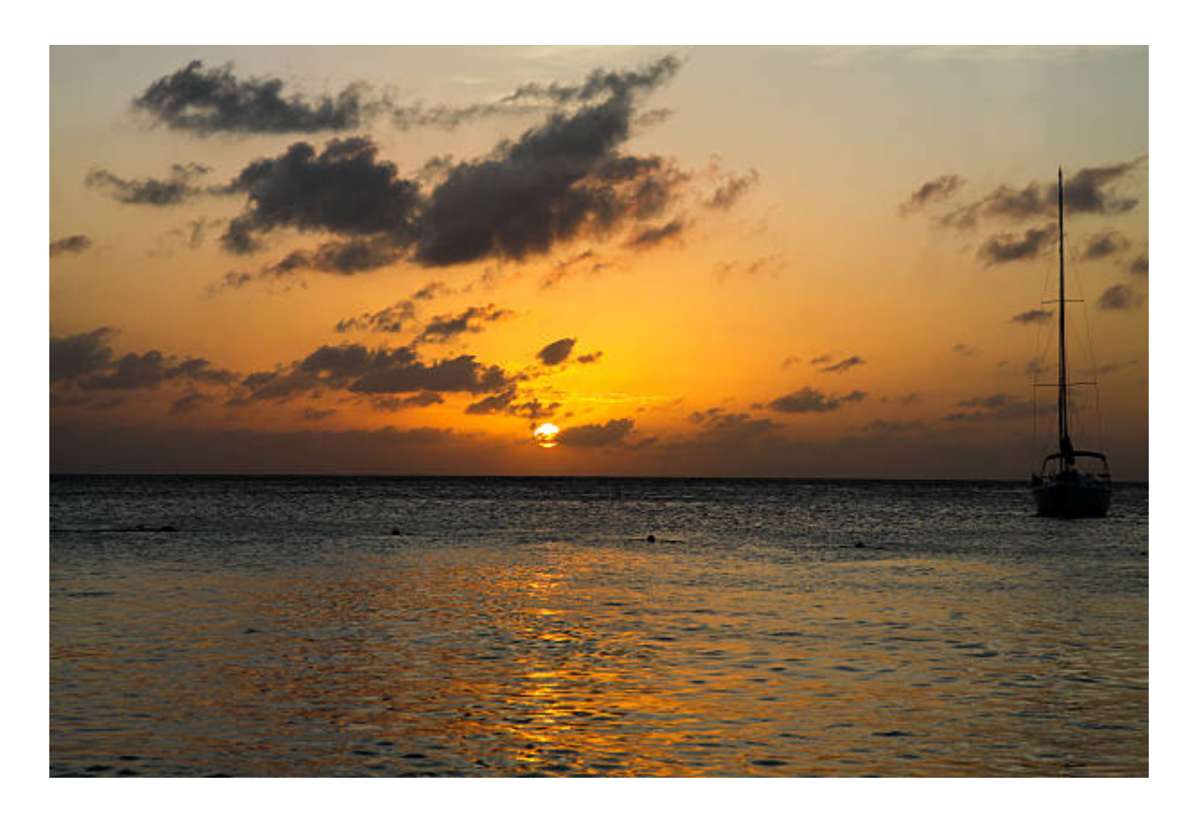
Day 6: Hurghada