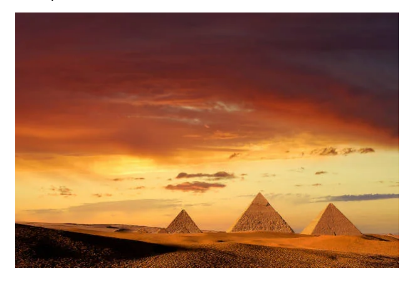
Day 2: Memphis, Sakkara, Pyramids Tour

the next day you will go to Alexandria we will take you to the Citadel of Qaitbay and then to Kom el-shukafa and the Pompey's Pillar that was built of granite stone,