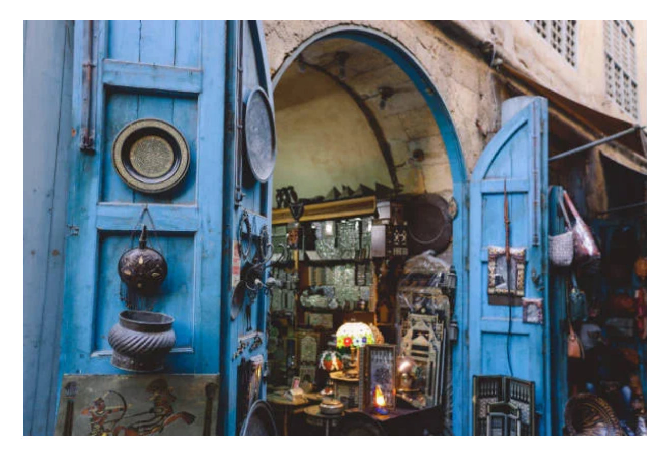
Day 6: Khan el-Khalili & Salah El-Din Citadel

the next day you will go to Alexandria we will take you to the Citadel of Qaitbay and then to Kom el-shukafa and the Pompey's Pillar that was built of granite stone ,