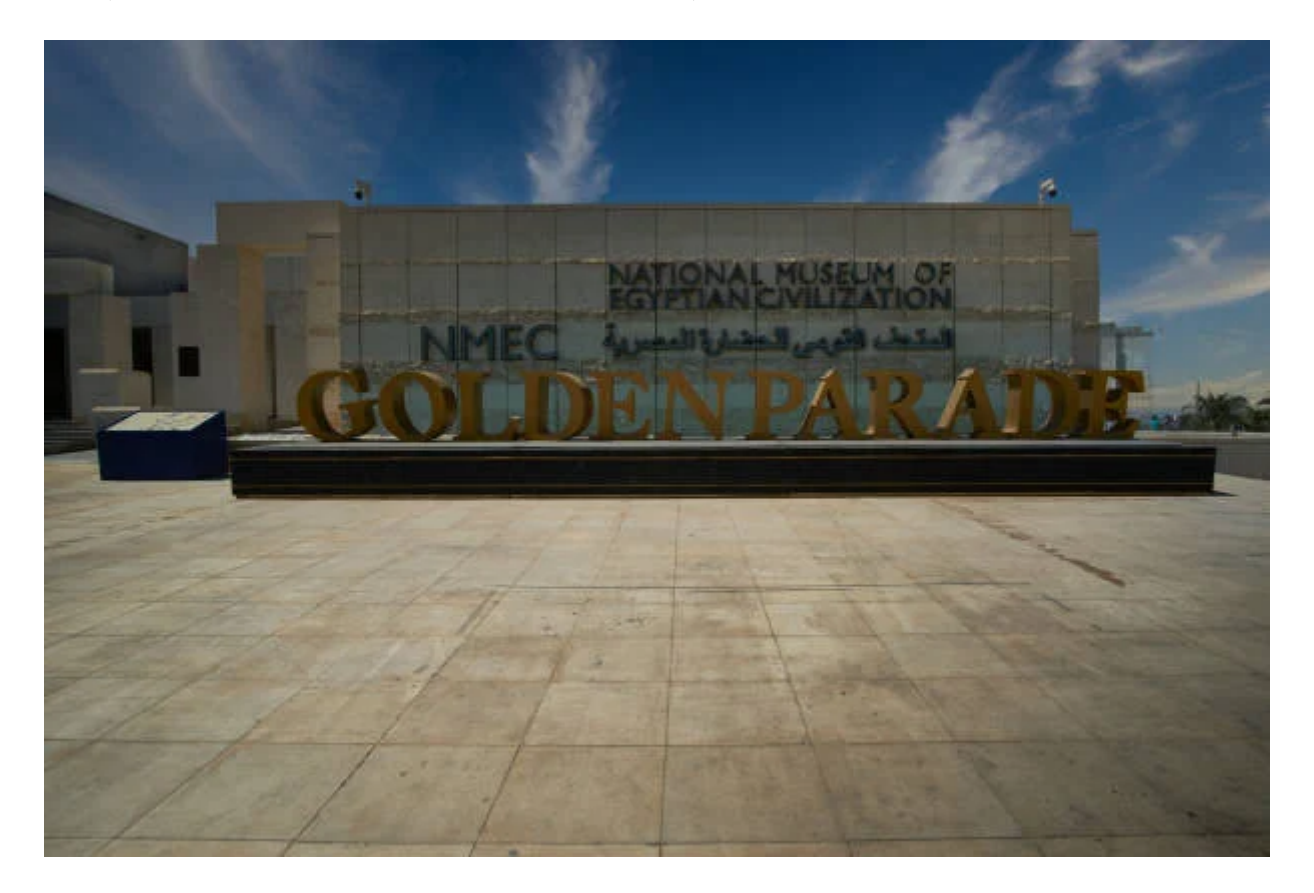
Day 4: Egyptian Museum, National Museum of Civilization, Old Cairo

the next day you will go to Alexandria we will take you to the Citadel of Qaitbay and then to Kom el-shukafa and the Pompey's Pillar that was built of granite stone,