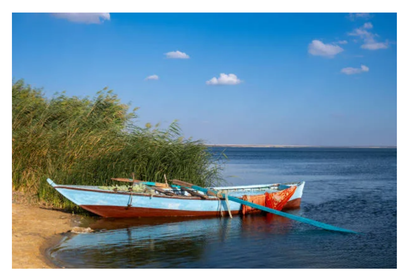
Day 4: Overday Fayoum

The journey of a long weekend Cairo starts at the first ever capital of ancient Egypt and the most important city in the world thousands of years ago, the ancient city of Memphis , Giza Pyramids and The next stop is Saqqara , the burial ground for Egyptian kings and royals, will go to the National Museum of Civilization , the Museum of Egypt , and the Museum of Coptic Civilization. There, you can find out more about the Jewish Temple and the suspended church. Our agent will transport you to AI-Fayoum the following morning after hotel breakfast, where he will offer you an interesting tour and drop you off at the Tunis village for breakfast. To purchase gifts, you will next travel to Salahuddin and then to Khan Khalil Bazar . A member of our group will drive you to the airport early the next morning.