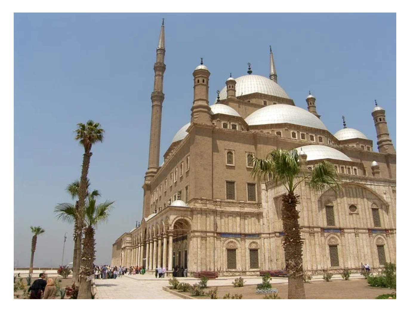
Day 5: Khan el-Khalili & Salah El-Din Citadel

The journey of a long weekend Cairo starts at the first ever capital of ancient Egypt and the most important city in the world thousands of years ago, the ancient city of Memphis , Giza Pyramids and The next stop is Saqqara , the burial ground for Egyptian kings and royals, will go to the National Museum of Civilization , the Museum of Egypt , and the Museum of Coptic Civilization. There, you can find out more about the Jewish Temple and the suspended church. Our agent will transport you to Al-Fayoum the following morning after hotel