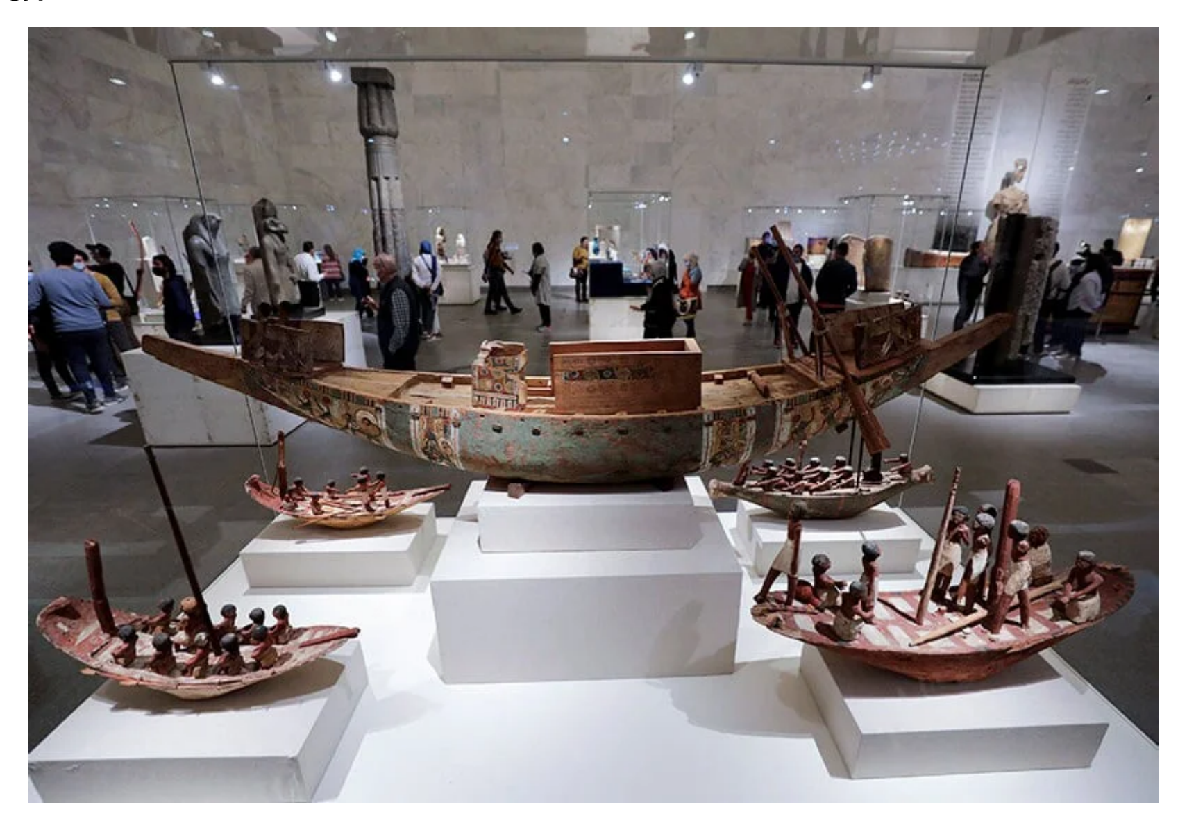
Day 3: Egyptian Museum, National Museum of Civilization, Old Cairo