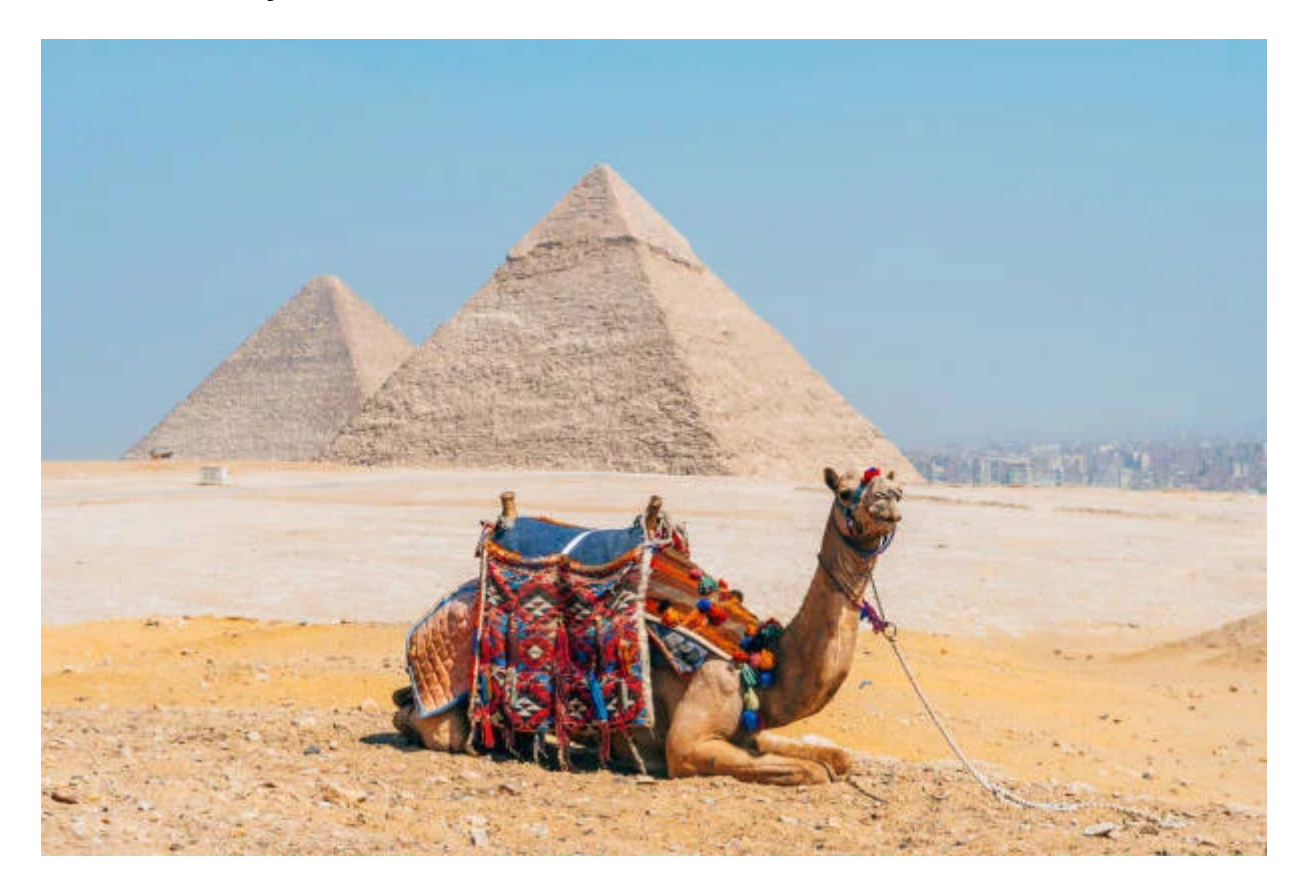
Day 2: Memphis, Sakkara, Giza Pyramids