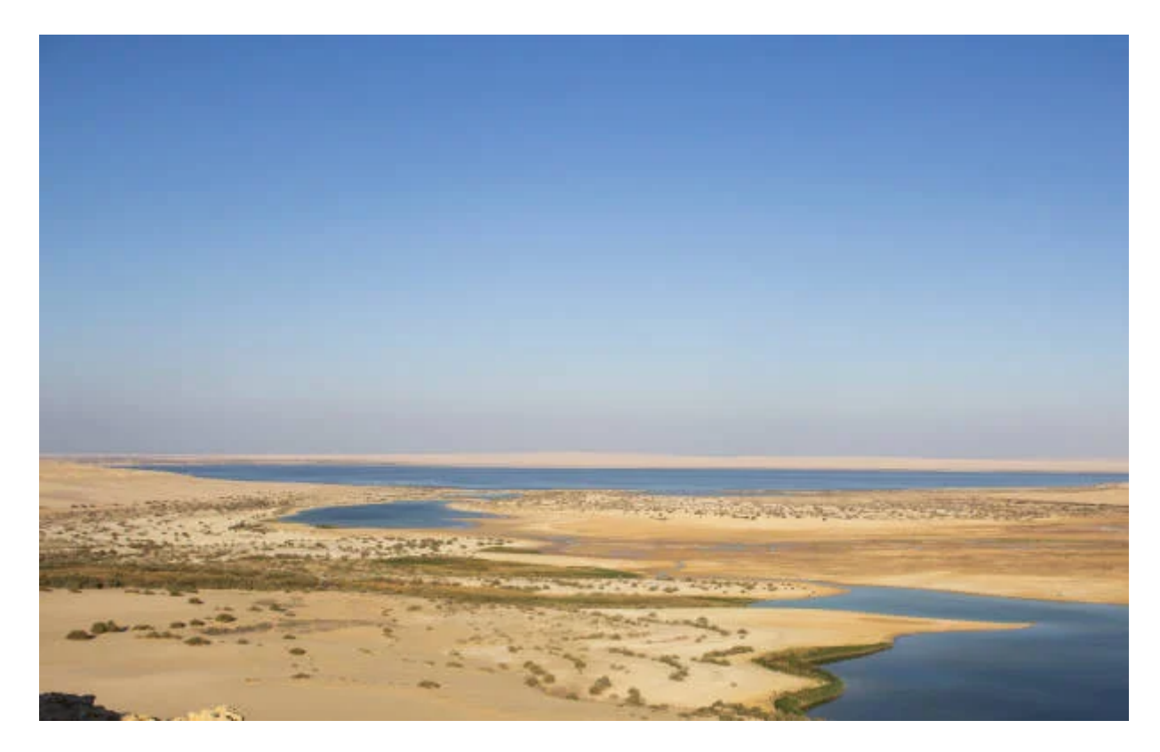
Day 5: Overday Fayoum