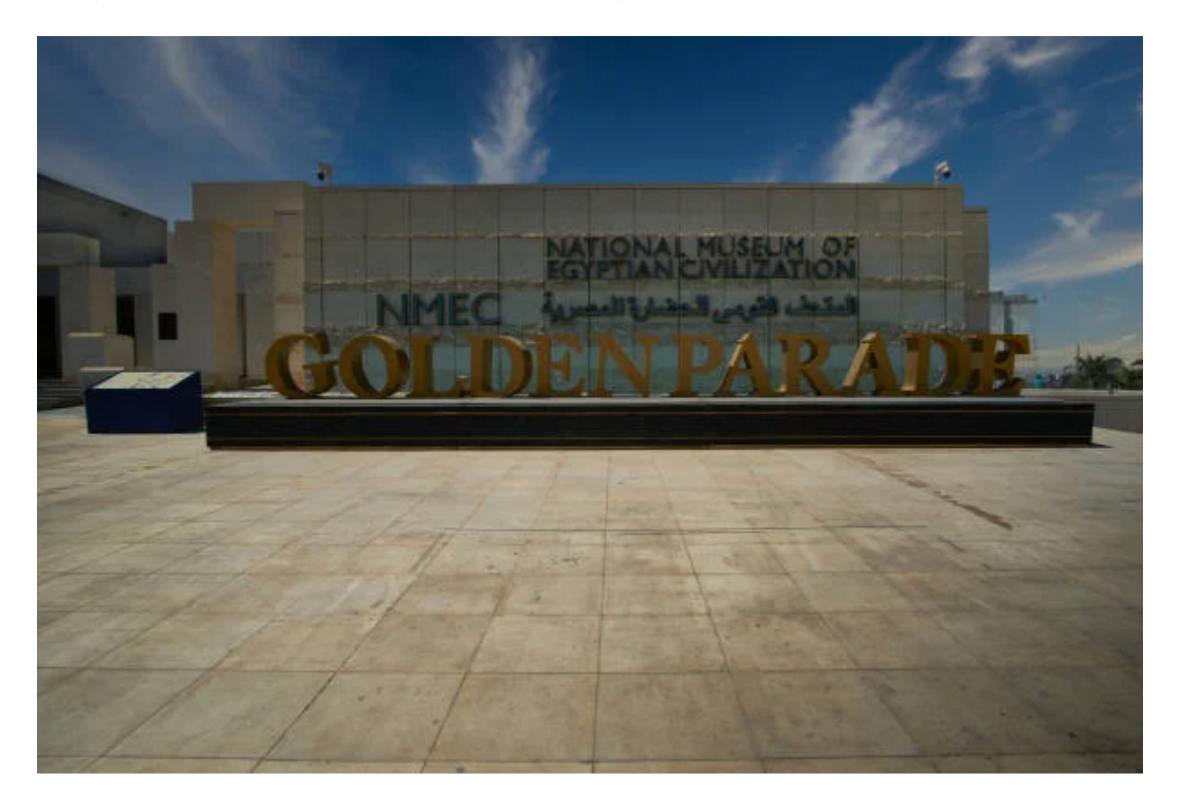
Day 3: Egyptian Museum, National Museum of Civilization, Old Cairo