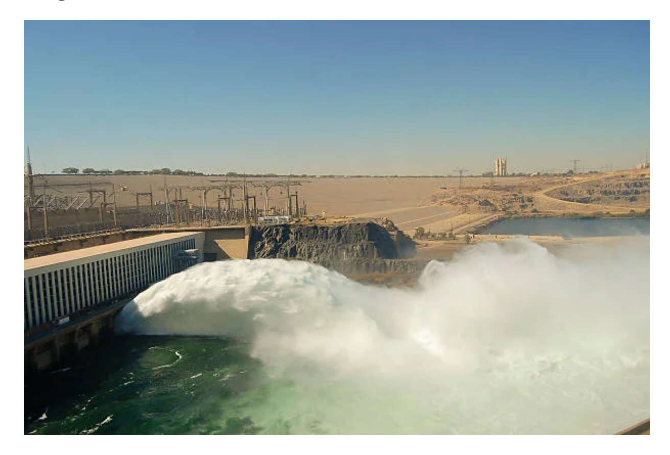
Day 4: Aswan Sightseeing