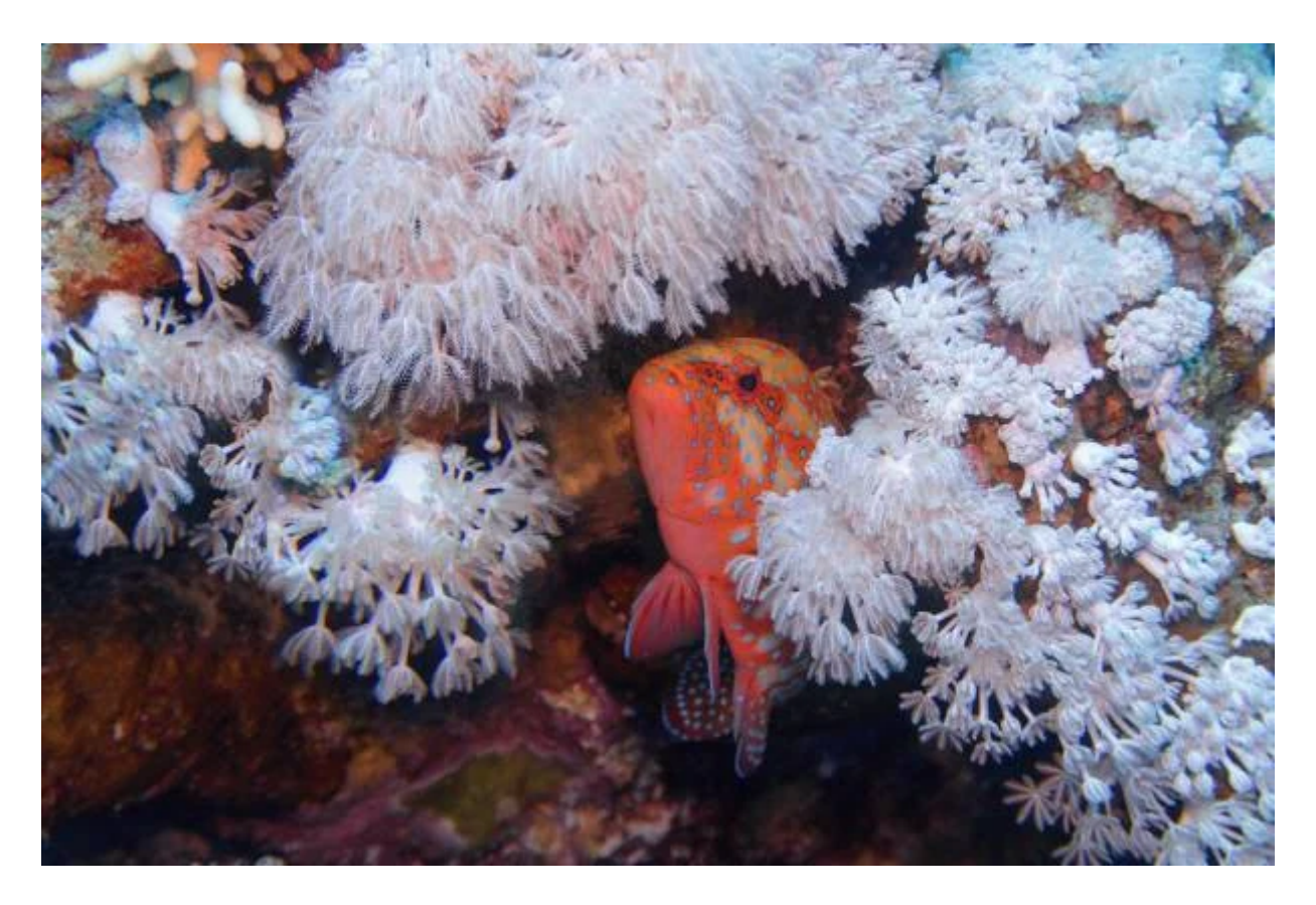
Day 8: Sharm El-Sheikh