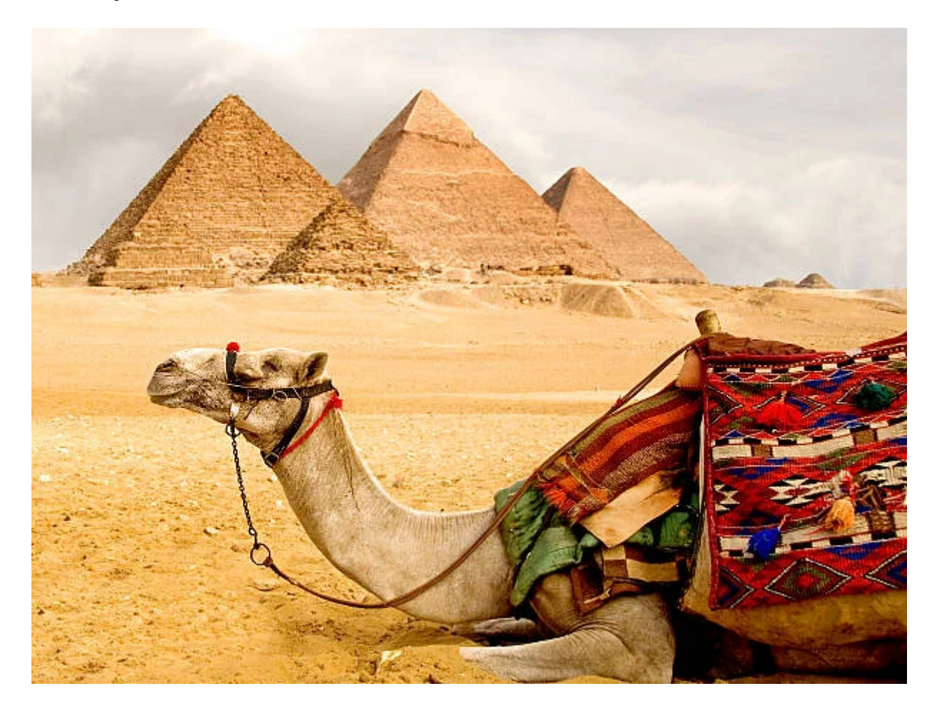
Day 2: Memphis, Sakkara, Pyramids Tour

You will meet our representative from Cairo airport once you arrive will welcome you and take you in-conditioned car to your hotel in Cairo to relax will go to the area of the pyramids of Giza to the pyramids of Khufu , Khafre , and Menkaure in addition to the Sphinx , and then will go for lunch at a local restaurant then you will go to Saqqara and then it will go to the area of the Memphis and the Egyptian Museum and the Church of knowledge and the Jews Temple , and then I will help to Aswan to its civilization and civilization of the Nile river you will look your journey visit the High Dam in Aswan after the IT missing and Phila Temple lunch on the boat at night. You will sail to Kom