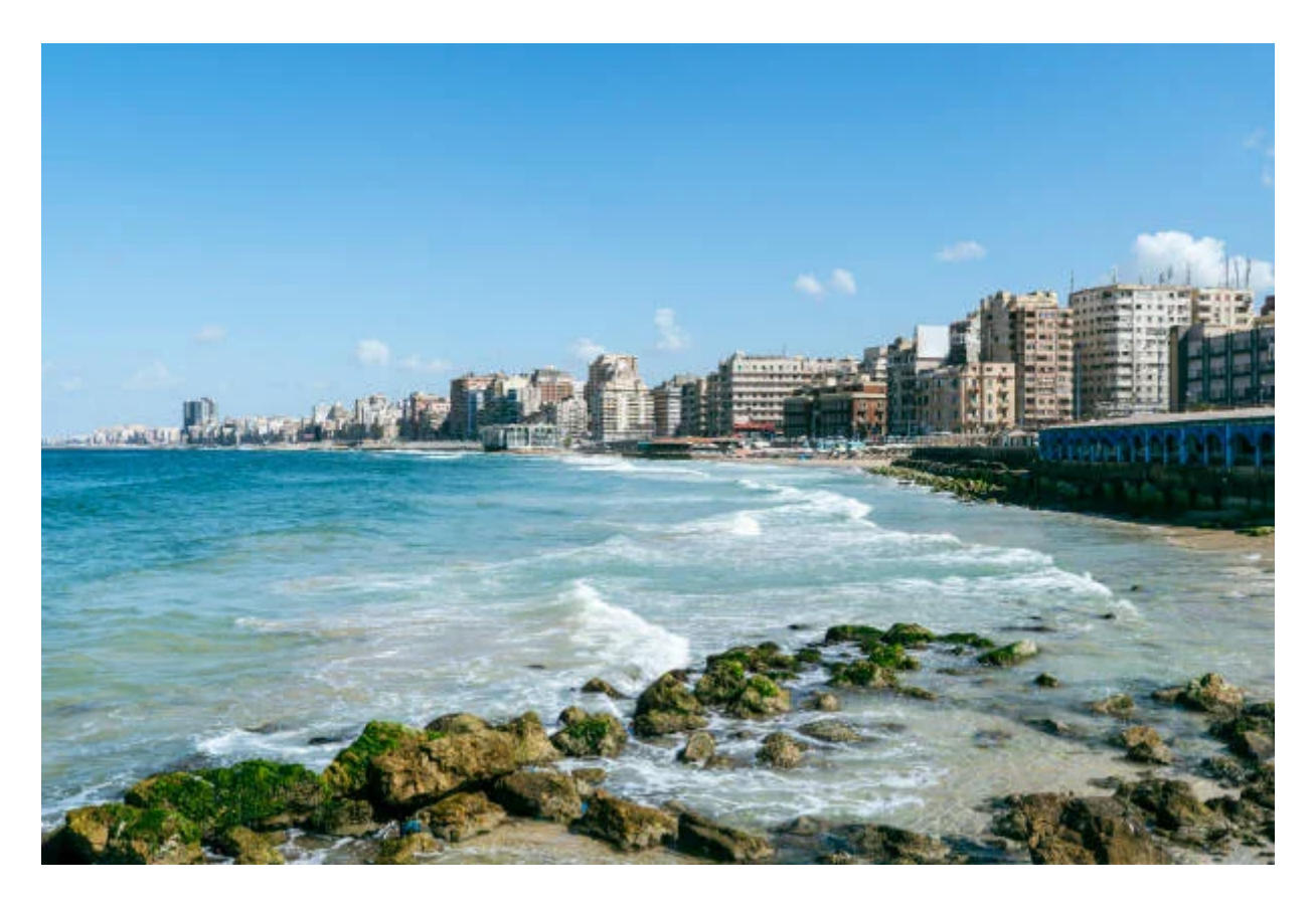
Day 3: Overday Alexandria