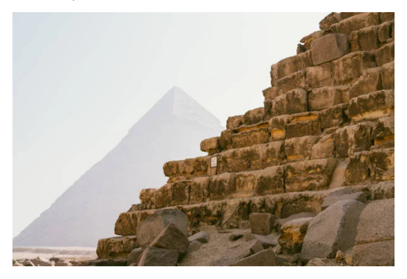
Day 2: Memphis, Sakkara, and Pyramids Tour