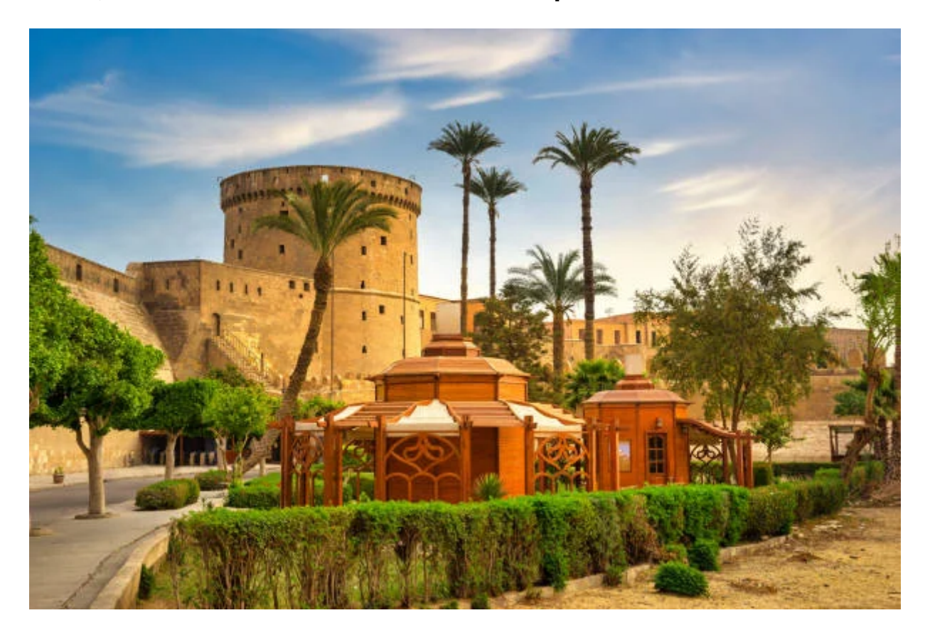
Day 5: Salah El-Din Citadel, Al-Sultan Hassan & Ibn Tulun Mosques

Once you arrive at the airport, we will take you to our representative by air-conditioned vehicle from the airport to your hotel in Cairo to rest after a tiring day of travel. You can spend the night quietly at our hotel in the morning of the next day. After eating breakfast, you will go with a professional guide to the pyramids of Giza , the three pyramids of Sakkara , and Memphis . After enjoying this tour, we will take you to a local restaurant for lunch and return to your hotel. The next day, we will take you to Alexandria to visit the Citadel of Qaitbay , where the king was in the late state of the Mamluks to protect them. To the pile of potsherds, which is one of the cemeteries in Alexandria, and in the evening, return to the hotel in Cairo to prepare to visit the Egyptian Museum , where there is a large collection of ancient relics, and then visit the National Museum of Civilization , which then takes you to the church and the Jews, where they learn about the nursery. Coptic Plus visits the Coptic Museum , and the next day reports to the Castle of Salah al-Din and then to the Khan El-Khalili Bazar where