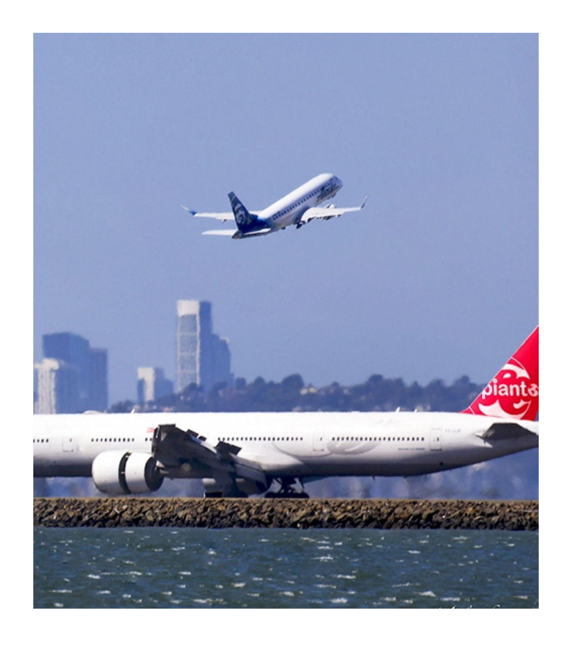
Day 6: Departure