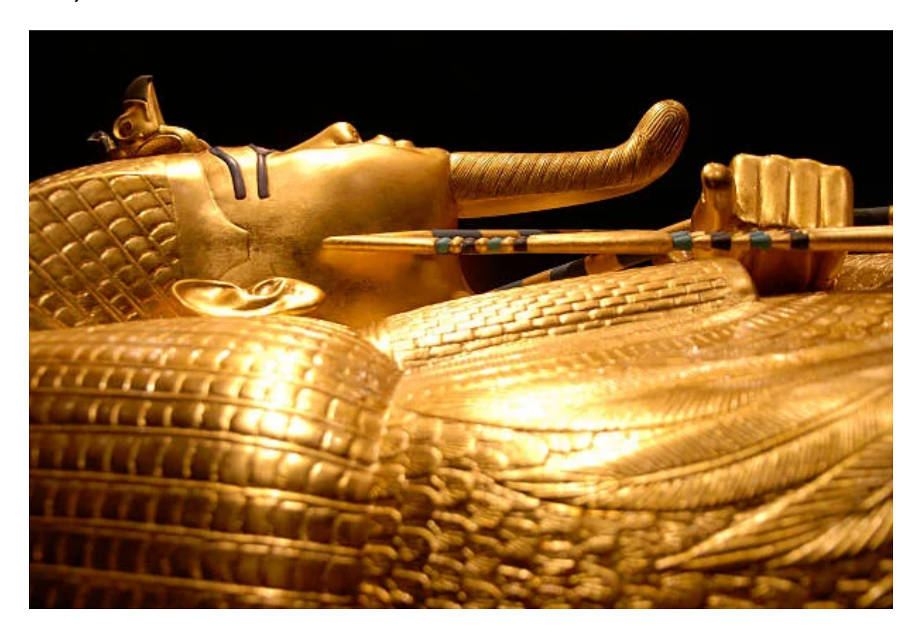
Day 3: Egyptian Museum, Old Cairo

When you arrive at Cairo airport, you will meet our representative, Sera, who is air-conditioned, and go to your hotel and spend the night fun and quiet. The next day, you will go to the area of the pyramids of Giza and see the pyramids, the three, and the Sphinx , and then visit the pyramids of Saqqara , some after, and then we will take you to our representative for lunch, then return to your hotel to relax. The morning of the next day, after eating breakfast, we will take you to our delegates to visit the Egyptian Museum and Religions, the Hanging Church , and the Jewish Museum , Coptic, and then take a break to eat lunch on the fourth day of your trip. After breakfast, you will go on a four-hour trip into the white desert on After about 350 km, you will stop to have lunch and some refreshments, also known as the jewel of the desert, because it is a hill of crystal-like crystals where you can watch suitable exhilarating when the light hits it, then it will be used in horses in the desert and dinner in the camp, but enjoy watching the stars, and the next day you can enjoy a full day in health. White will use the location