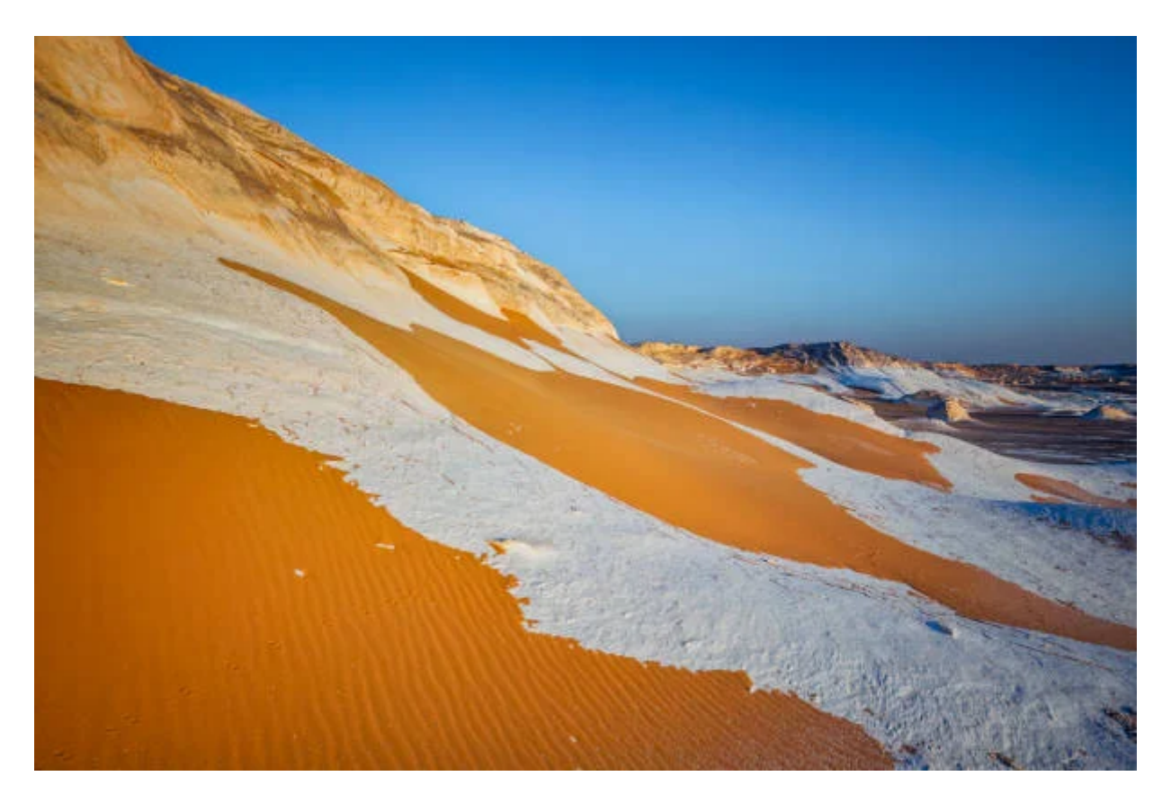
Day 4: Cairo- White Desert

When you arrive at Cairo airport, you will meet our representative, Sera, who is air-conditioned, and go to your hotel and spend the night fun and quiet. The next day, you will go to the area of the pyramids of Giza and see the pyramids, the three, and the Sphinx , and then visit the pyramids of Saqqara , some after, and then we will take you to our representative for lunch, then return to your hotel to relax. The morning of the next day, after eating breakfast, we will take you to our delegates to visit the Egyptian Museum and Religions, the Hanging Church , and the Jewish Museum , Coptic, and then take a break to eat lunch on the fourth day of your trip. After breakfast, you will go on a four-hour trip into the white desert on After about 350 km, you will stop to have lunch and some refreshments, also known as the jewel of the desert, because it is a hill of crystal-like crystals where you can watch suitable exhilarating when the light hits it, then it will be used in horses in the desert and dinner in the camp, but enjoy watching the stars, and the next day you can enjoy a full day in health. White will use the location