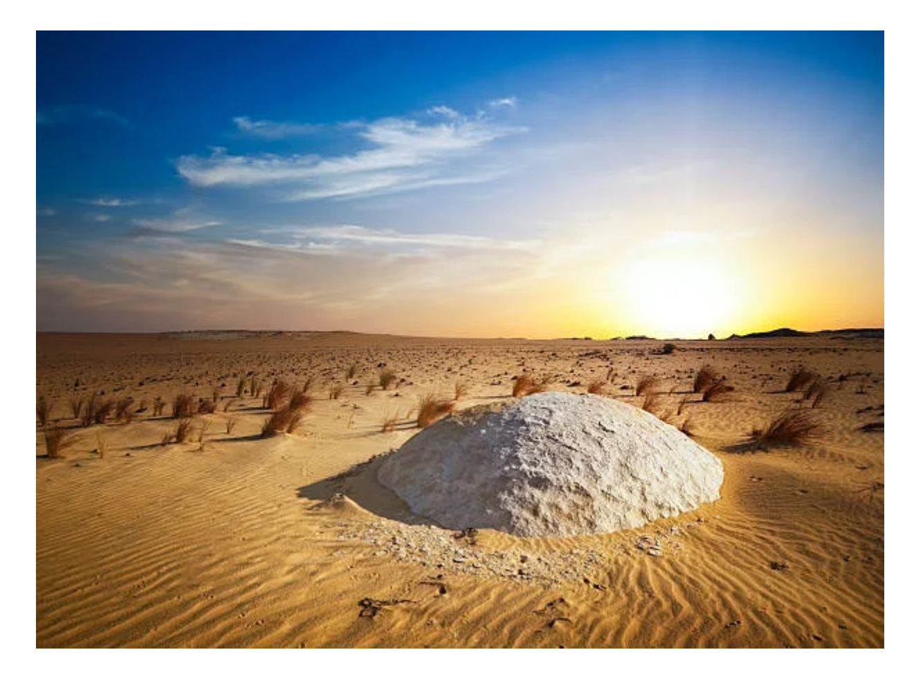
Day 5: White Desert

When you arrive at Cairo airport, you will meet our representative, Sera, who is air-conditioned, and go to your hotel and spend the night fun and quiet. The next day, you will go to the area of the pyramids of Giza and see the pyramids, the three, and the Sphinx , and then visit the pyramids of Saqqara , some after, and then we will take you to our representative for lunch, then return to your hotel to relax. The morning of the next day, after eating breakfast, we will take you to our delegates to visit the Egyptian Museum and Religions, the Hanging Church , and the Jewish Museum , Coptic, and then take a break to eat lunch on the fourth day of your trip. After breakfast, you will go on a four-hour trip into the white desert on After about 350 km, you will stop to have lunch and some refreshments, also known as the jewel of the desert,