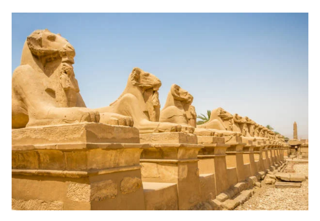
Day 1: Check in