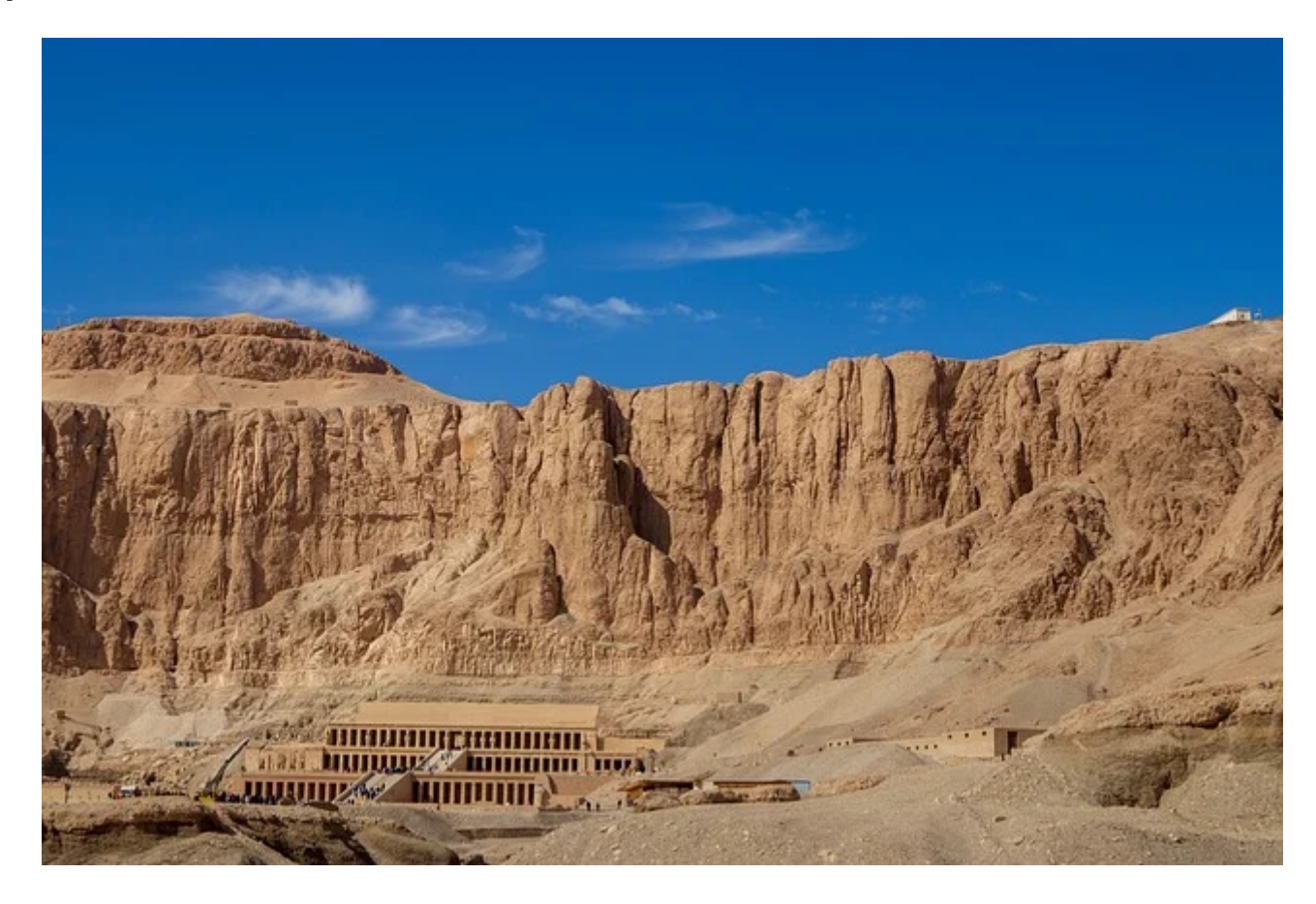
Day 3: Luxor Temples

We will take you on a cruise to get acquainted with the ruins of Aswan in the morning after breakfast, our delegate will take you to the High Dam and the missing obelisk , in addition to the phial ' distance, and back again for lunch and spend the night on the boat and sail to Kom Ombo and the next day our delegate will take you with a professional guide to visit on board your boat, these visits include the valley of the Kings , the valley of the Queens and Hatshepsut , then have lunch to complete your enjoyable sea trip to visit the Karnak Temple and Luxor , dinner in the evening and take a break the next morning our representative will take you after breakfast to Luxor airport in an airconditioned car, carrying with you unforgettable memories