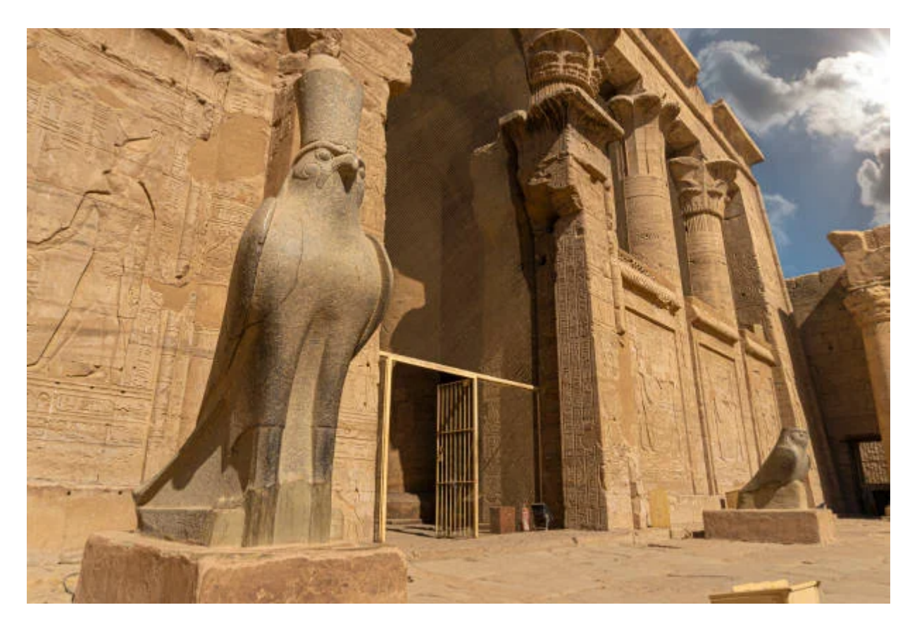
Day 2: Kom Ombo, Edfu

We will take you on a cruise to get acquainted with the ruins of Aswan in the morning after breakfast, our delegate will take you to the High Dam and the missing obelisk , in addition to the phial ' distance, and back again for lunch and spend the night on the boat and sail to Kom Ombo and the next day our delegate will take you with a professional guide to visit on board your boat, these visits include the valley of the Kings, the valley of the Queens and Hatshepsut , then have lunch to complete your enjoyable sea trip to visit the Karnak Temple and Luxor, dinner in the evening and take a break the next morning our representative will take you after breakfast to Luxor airport in an air conditioned car, carrying with you unforgettable memories