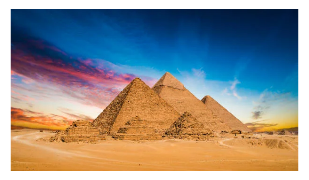
Day 2: Memphis, Sakkara, Pyramids Tour