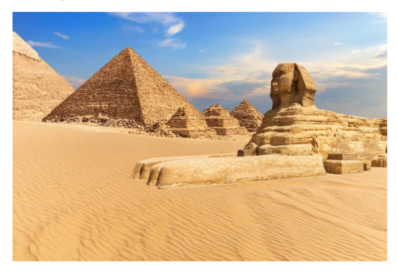
???? 2: Memphis , Sakkara , Pyramids Tour

When you arrive at the airport, our representative will receive you and welcome you. After that, you will go to the Pyramids of Giza , then to Memphis and the Step Pyramid of Saqqara . The next day, you will go to the Egyptian Museum in Tahrir and the Museum of National Egyptian Civilization . Then our representative will take you to learn about the Coptic civilization and go to the Hanging Church . On the last day, after eating breakfast, At the hotel, our representative will take you back to the airport.