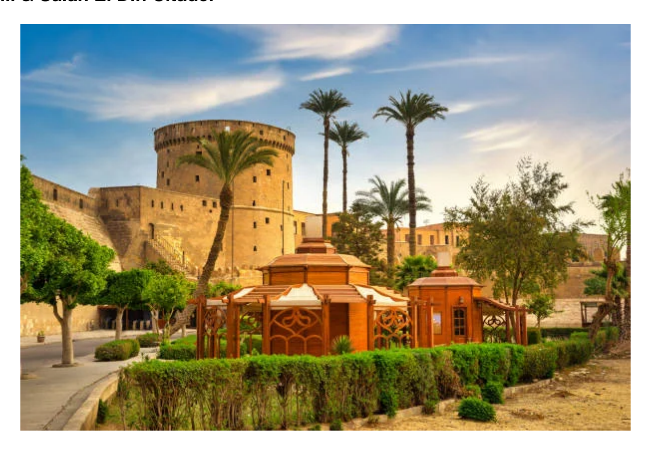
Dia 4: khan El-Khalili & Salah El Din Citadel

When you arrive at Cairo airport, our representative will take you to the hotel and the next day you will go to the Pyramids of Giza and then Saqqara and then Memphis and have lunch at a local restaurant the next day have breakfast at the hotel, our representative will take you to the National Museum of Civilization and then to the Egyptian Museum and then you will get acquainted with the Coptic civilization, where the Jewish Temple , The Hanging Church and Mary of Gergs ,