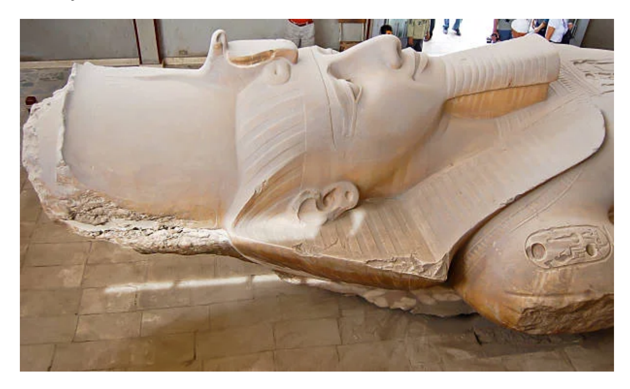
Dia 2: Memphis, Sakkara, Pyramids Tour

Our representatives will take you on an interesting free time tour of Cairo and visit the archaeological sites of Paris, where the Egyptian Museum includes a large collection of statues and antiquities.. We will also take you on a tour of the pyramids , Memphis , Saqqara and the continent which you can enjoy on a tour of Coptic and Islamic antiquities,