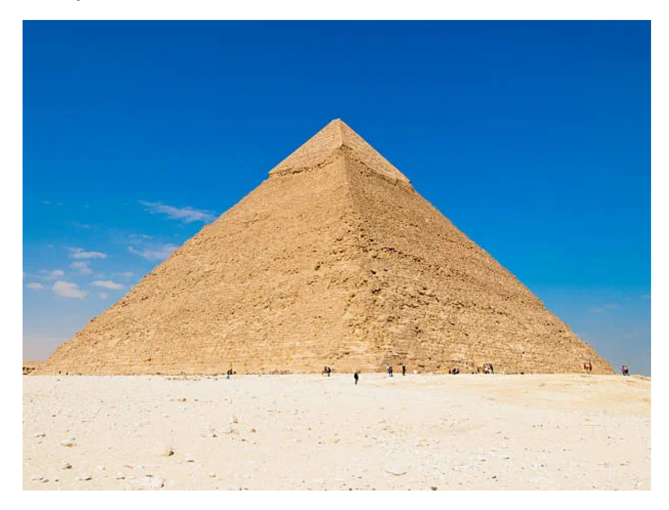
Dia 2: Memphis, Sakkara, Pyramids Tour

Once you arrive at the airport, we will take you to our representative by air-conditioned vehicle from the airport to your hotel in Cairo to rest after a tiring day of travel. You can spend the night quietly at our hotel in the morning of the next day. After eating breakfast, you will go with a professional guide to the pyramids of Giza , the three pyramids of Sakkara , and Memphis . After enjoying this tour, we will take you to a local restaurant for lunch and return to your hotel. The next day, we will take you to Alexandria to visit the Citadel of Qaitbay , where the king was in the late state of the Mamluks to protect them. To the pile of potsherds, which is one of the cemeteries in Alexandria, and in the