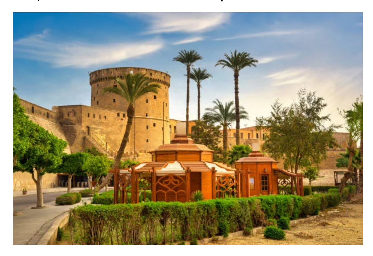
Dia 5: Salah El-Din Citadel, Al-Sultan Hassan & Ibn Tulun Mosques

Once you arrive at the airport, we will take you to our representative by air-conditioned vehicle from the airport to your hotel in Cairo to rest after a tiring day of travel. You can spend the night quietly at our hotel in the morning of the next day. After eating breakfast, you will go with a professional guide to the pyramids of Giza , the three pyramids of Sakkara , and Memphis . After enjoying this tour, we will take you to a local restaurant for lunch and return to your hotel. The next day, we will take you to Alexandria to visit the Citadel of Qaitbay , where the king was in the late state of the Mamluks to protect them. To the pile of potsherds, which is one of the cemeteries in Alexandria, and in the evening, return to the hotel in Cairo to prepare to visit the Egyptian Museum , where there is a large collection of ancient relics, and then visit the National Museum of Civilization , which then takes you to the church and the Jews, where they learn about the nursery. Coptic Plus visits the Coptic Museum , and the next day reports to the Castle of Salah al-Din and then to the Khan El-Khalili Bazar where